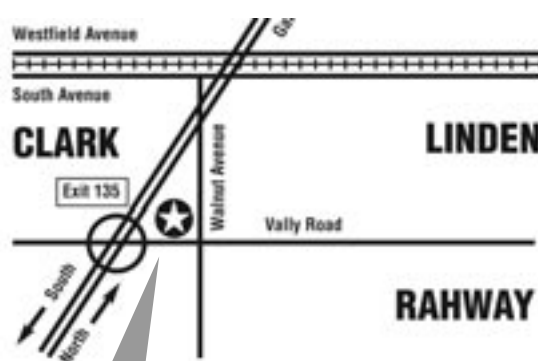
CLARK HOLIDAY INN

June 20 thru July 24 EMBASSY SUITES by HILTON PARSIPPANY