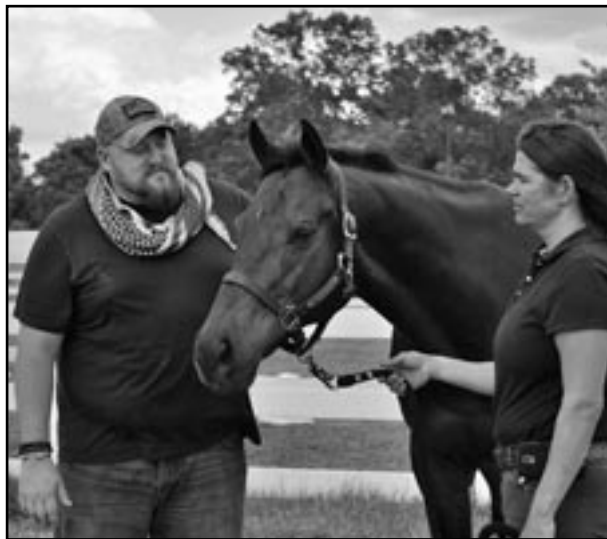
(above) The Man o' War Project has helped to develop a standardized protocol for delivering equine-assisted therapy to treat PTSD.

The Children of the American Revolution (C.A.R.) is the nation's oldest and largest nonpolitical patriotic youth organization. A new C.A.R. state project that will aid veterans has been announced. The goal of "Operation Horse" is to raise $2,000 during the next year to fund equine-assisted therapy for two N.J. veterans