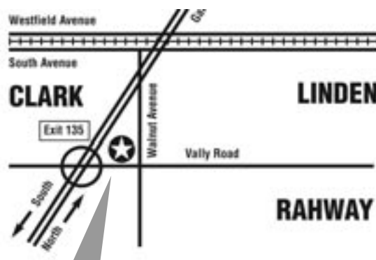
CLARK HOLIDAY INN