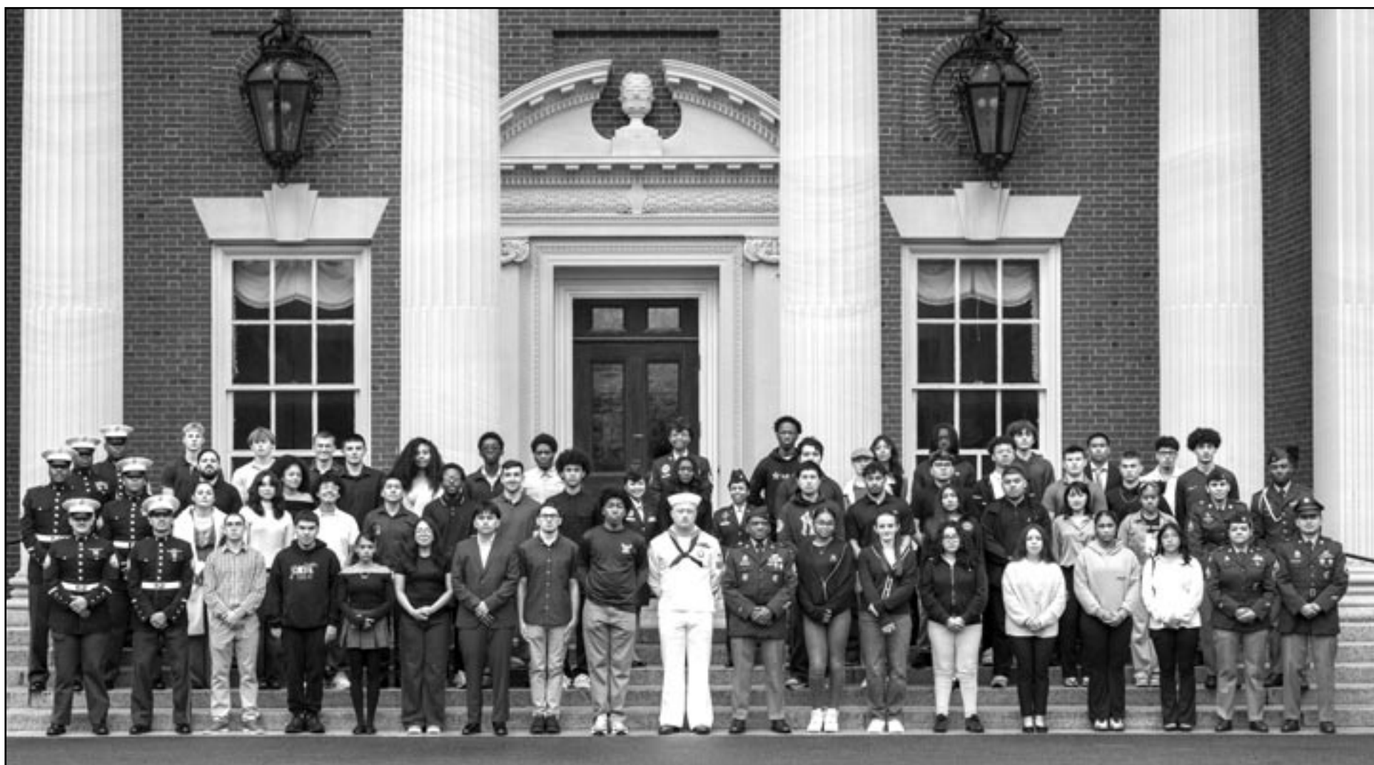
(above) Our Community Salutes of North Jersey 2026, High School Enlistees

The act of honoring veterans isn't just about looking back - it is an investment in the future of the nation. Through grassroots support and community recognition, these young patriots receive a powerful message: their sacrifice is valued, their service is celebrated, and their legacy is America's ongoing story.