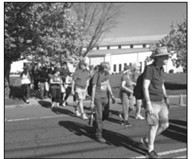
(above) Walkers began the Camino from St. Helen's Church in Westfield.

"Share your bread with the hungry and shelter the homeless poor" - (Isaiah 58)