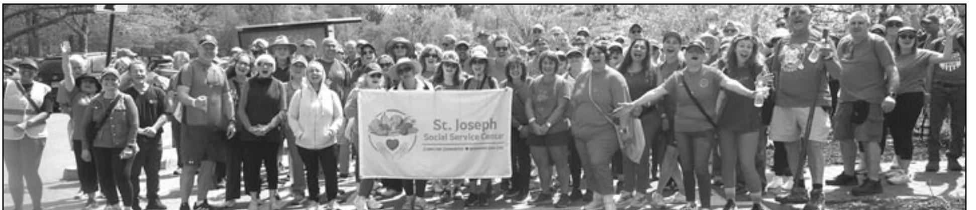
(above) Walkers arriving at St. Joseph Social Service Center in Elizabeth.