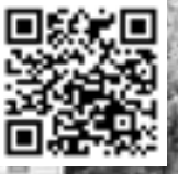
14 Chester Lang Place, Cranford 3 Bedrooms | 2 Baths | $789,000