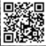
414 Hillside Avenue, Westfield 5 Bedrooms | 5.2 Baths | Price Upon Request