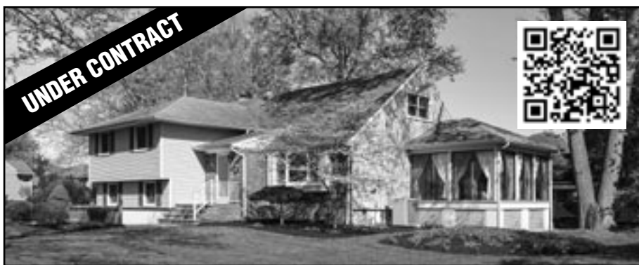
38 Genesee Trail, Westfield 4 Bedrooms | 2.1 Baths | $1,225,000