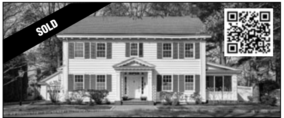
731 Boulevard, Westfield 4 Bedrooms | 2.1 Baths | $1,900,000