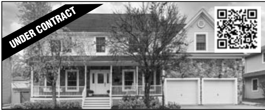
60 Mohawk Trail, Westfield 5 Bedrooms | 4 Baths | $1,675,000