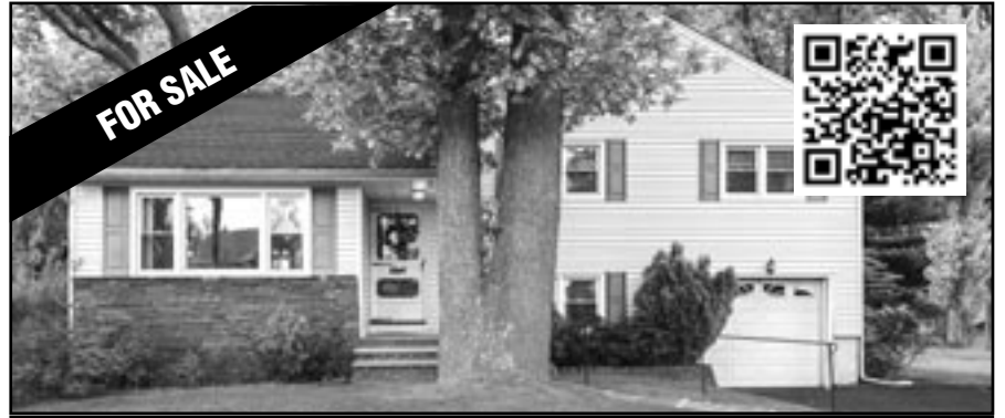
14 Chester Lang Place, Cranford 3 Bedrooms | 2 Baths | $789,000