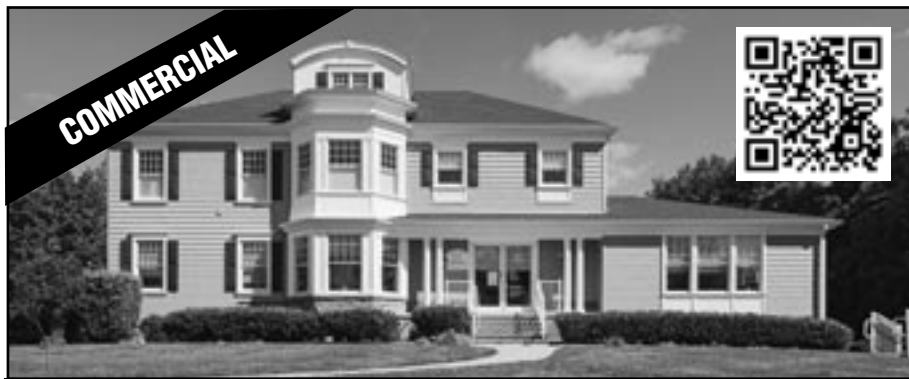
502 E Broad Street, Westfield For Sale: $3,500,000 | For Rent: $11,750