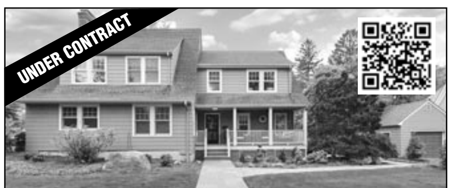
735 Belvidere Avenue, Westfield 4 Bedrooms | 3.1 Baths | $1,595,000