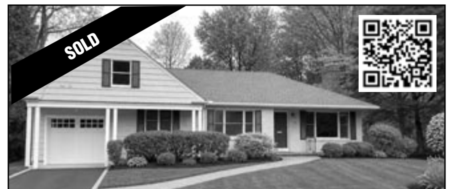
130 Greenwood Road, Mountainside 3 Bedrooms | 2.1 Baths | $1,761,800