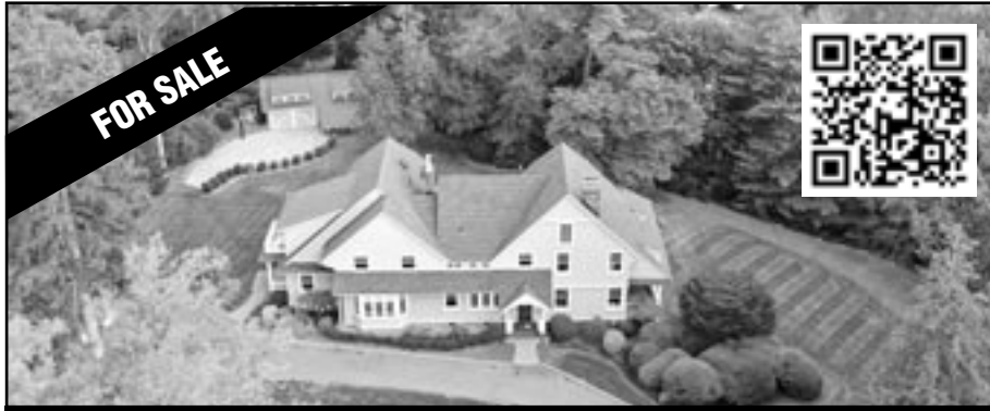
414 Hillside Avenue, Westfield 5 Bedrooms | 5.2 Baths | Price Upon Request