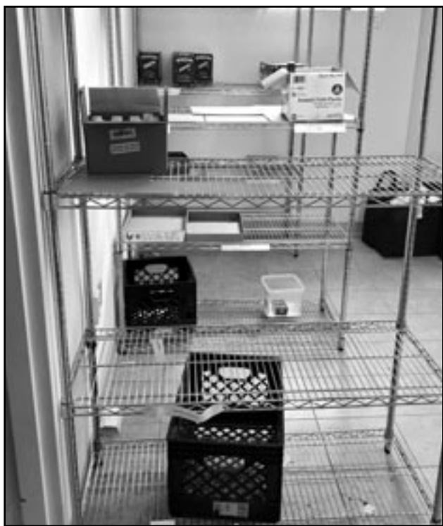
(above) Supplies in the Roseland Food Pantry are extremely low and we need your help to restock the pantry! A full list of needed and desired items are available on our website and can be dropped off at Borough Hall.

Residents and non-residents alike can support the food pantry by making a donation on the Borough website to the Roseland Relief Fund, the official Borough trust fund which supports the Food Pantry and Roseland residents in need.