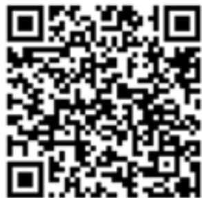
(above) Those interesting volunteering can use the QR code for more information.

Pay-One-Price Unlimited Ride wristbands are available for opening day, Thursday, June 4. Wristbands will be sold at the Feast for $35. Visit the Church of the Assumption website at http://www.assumptionrp.com/ for more information and sponsorship opportunities. If you would like to volunteer at the Feast of St. Anthony, scan here: