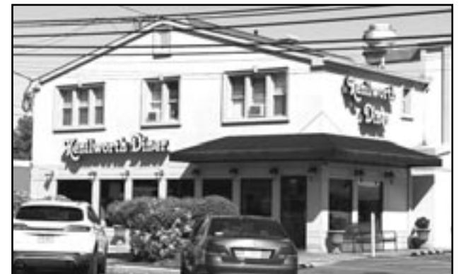
(above) Kenilworth Diner, 2026.