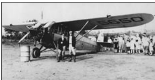
(above) Diner parking lot was once part of landing field, ca. 1928.