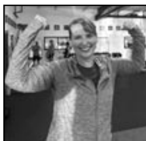
I feel better at 58 than I did at 45!