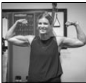
I feel better at 40 than I did at 26!

Don't take our word for it. The faces below belong to accountants and teachers and grandparents and business owners — your neighbors, basically. Read what they say in their own words, then decide if it's your turn.