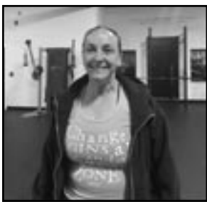
I feel better at 50 than I did at 40!