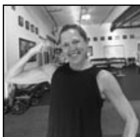
I feel better at 56 than I did at 35!