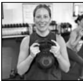
I feel better at 47 than I did at 40!