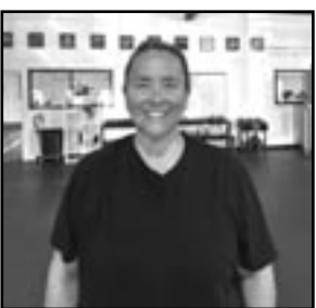
I feel better at 51 than I did at 25!

GABRIELE FITNESS HAS OPENED 13 SPOTS FOR LOCAL RESIDENTS TO EXPERIENCE THEIR PERSONAL TRAINING PROGRAM...FREE FOR 14 DAYS. OFFER EXPIRES MAY 6TH!