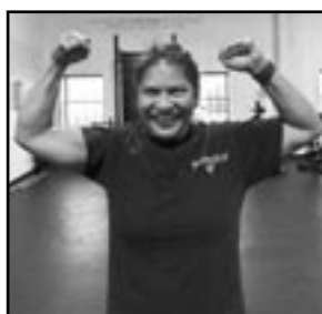
I feel better at 56 than I did at 47!