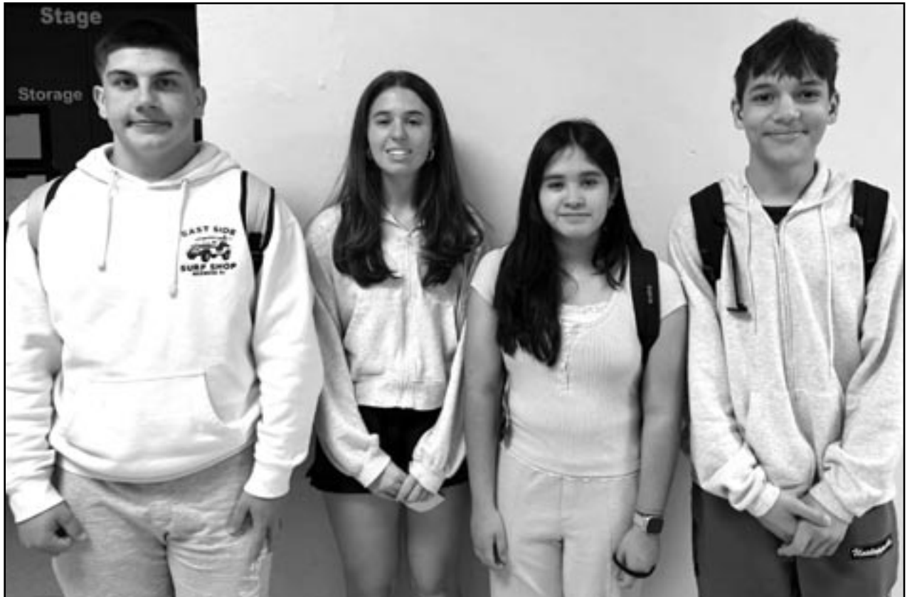
(above) Congratulations to our student authors for this outstanding achievement!