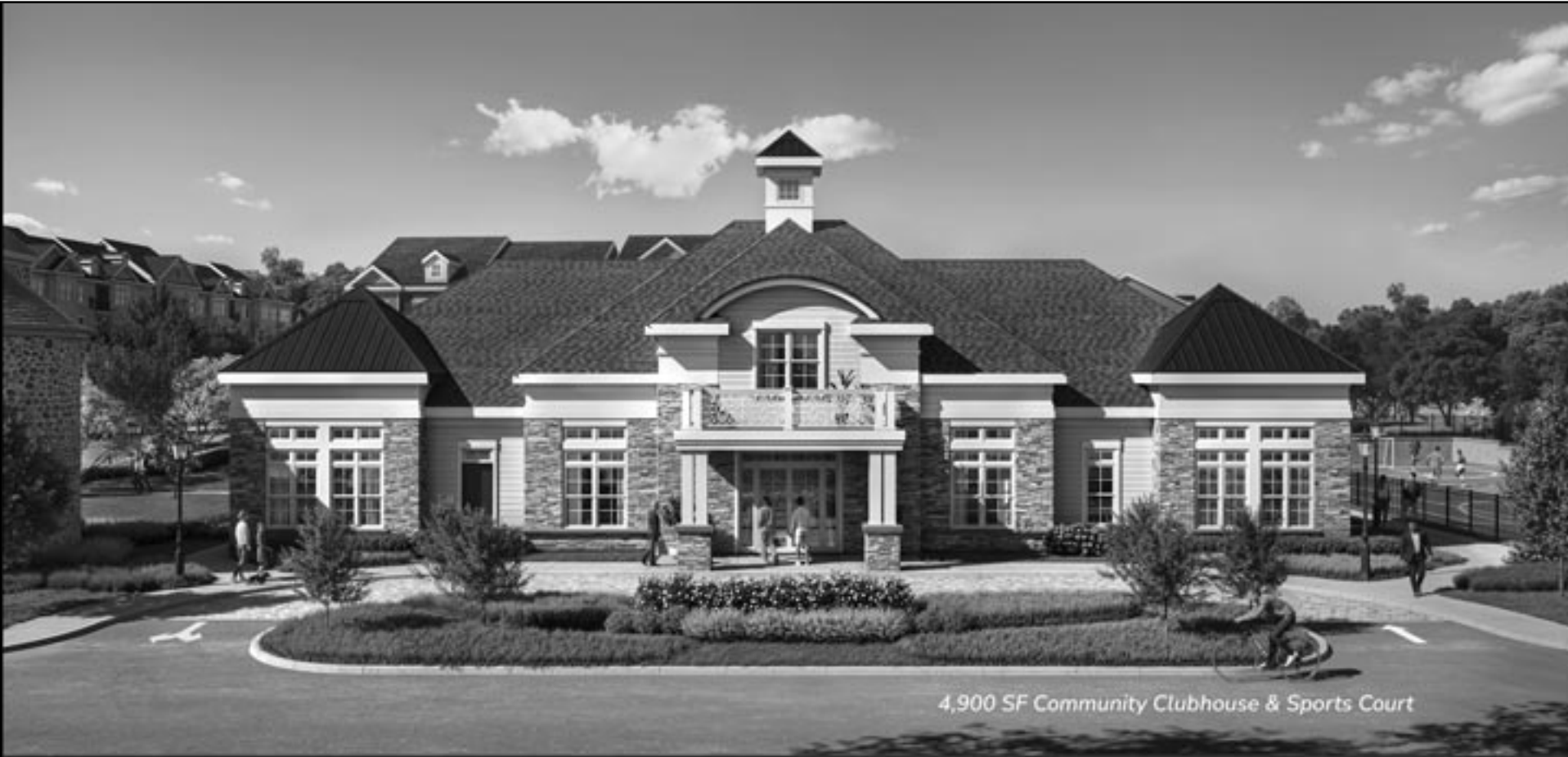
4,900 SF Community Clubhouse & Sports Court