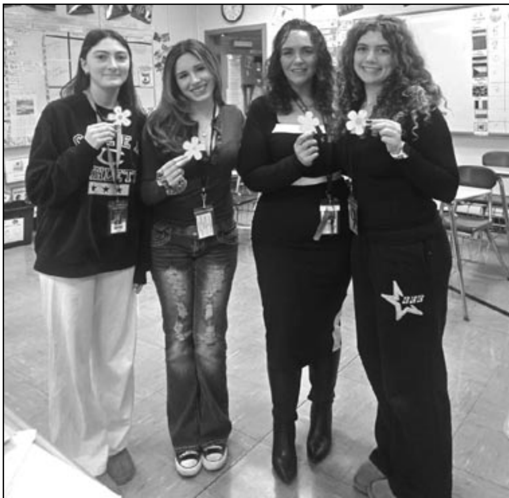
(above) Students recently celebrated International Women's Day with a special act of appreciation for the women who help make their school community strong every day.

Through this activity, students not only learned about an important cultural tradition, but also had the opportunity to show gratitude to the many women who help make Arthur L. Johnson High School a supportive and inspiring place to learn.