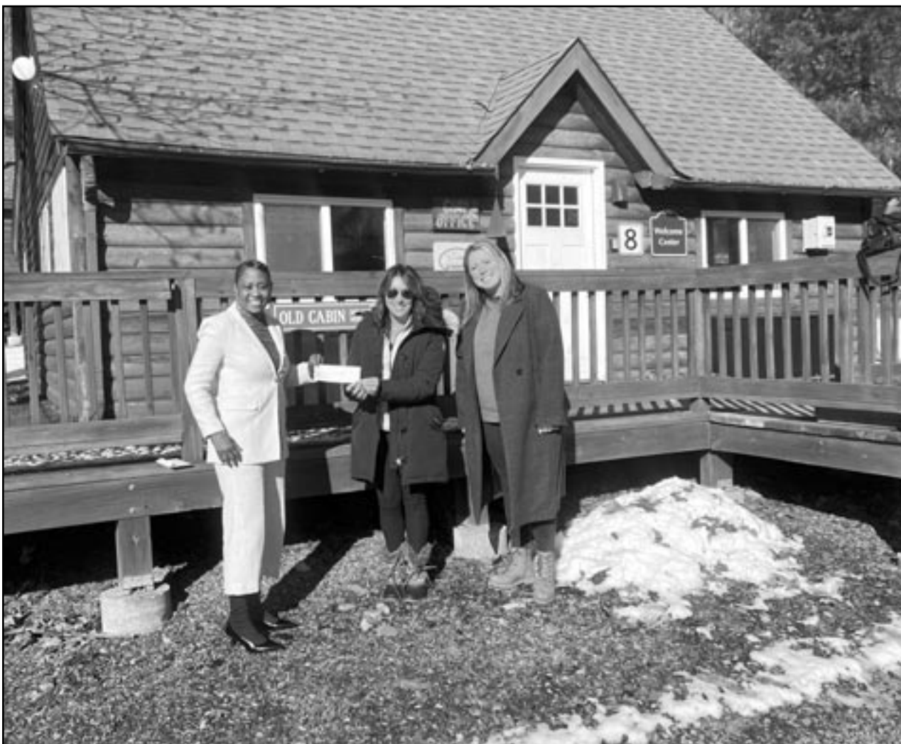
(above) A check presentation was held on December 1, 2025 by Morristown Rotary Club members for the new teamwork challenge for Girl Scouts at Jockey Hollow Camp in Mendham.

Girl Scouts of Northern New Jersey serves girls across Bergen, Morris, Passaic, Sussex, and Warren counties, and the northern part of Essex County. GSNNJ provides leadership development opportunities for girls ages 5-18 through programs that build courage, confidence, and character, who make the world a better place.