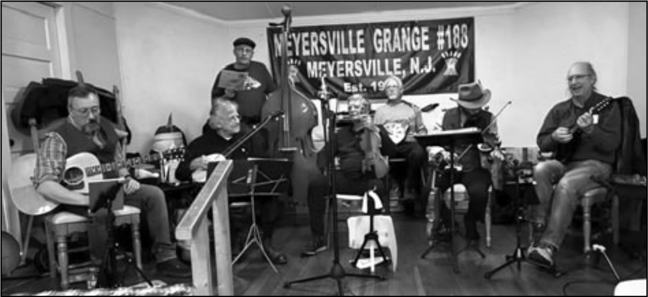
(above) The Long Hill String Band.

Admission: $10.00 Adult; $5.00 Child under 12. Cooks who Enter the Contest: Free! We hope you will join in the fun!