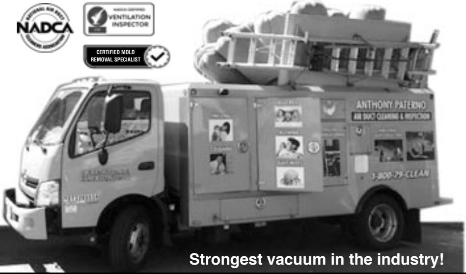
Strongest vacuum in the industry!

In business for 35 years using state-of-the-art equipment and professionally trained staff. Certified Ventilation Inspector (CVI) Certified Mold Removal Specialist (MRS) Member of National Air Duct Cleaners Association