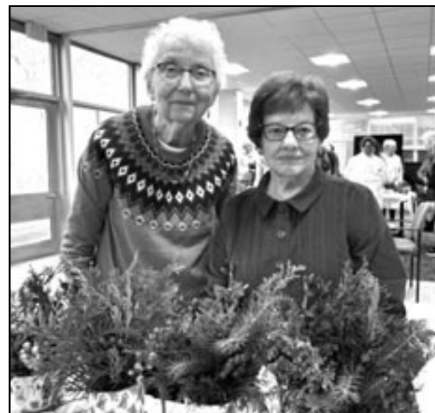
(above) Our thanks to the Town and Country Garden Club of Chatham for returning to teach the always-popular holiday centerpiece project.