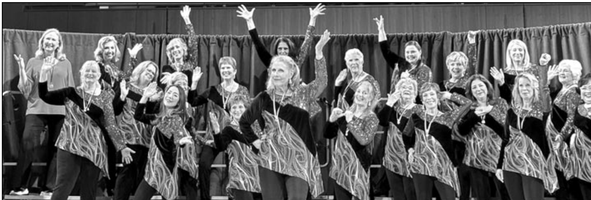
(above) The award-winning Hickory Tree Chorus invites you to join the sisterhood. For details and to schedule your audition, email us at info@hickorytreechorus.org or call 908-377-1399.

For details and to schedule your audition, email us at info@hickorytreechorus.org or call 908-377-1399.