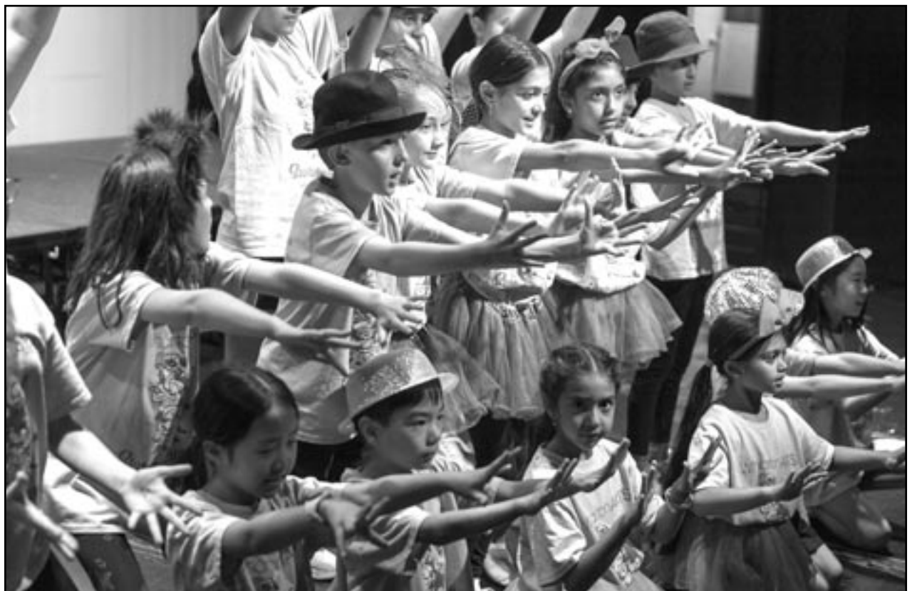
(above) PAS is pleased to announce that all 2026 Summer Camps will take place at a new location: 570 Central Avenue in New Providence.

Wharton Arts is located in Berkeley Heights, New Providence, and Paterson, NJ and reaches students from 12 counties. All of Wharton Arts’ teaching artists, faculty members, and conductors hold degrees in their teaching specialty and have been vetted and trained.