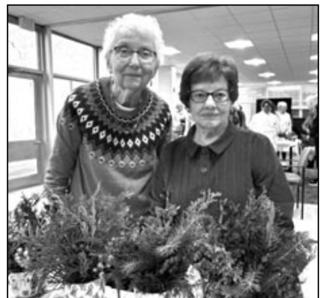
(above) Our thanks to the Town and Country Garden Club of Chatham for returning to teach the always-popular holiday centerpiece project.