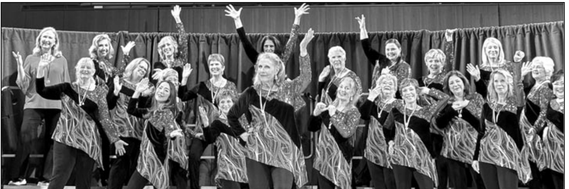
(above) The award-winning Hickory Tree Chorus invites you to join the sisterhood. For details and to schedule your audition, email us at info@hickorytreechorus.org or call 908-377-1399.

For details and to schedule your audition, email us at info@hickorytreechorus.org or call 908-377-1399.