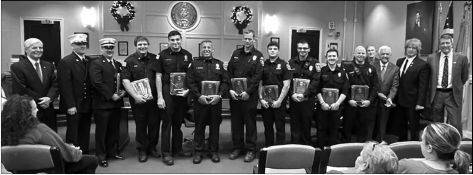
(above) Whippany Fire Department Swiftwater Rescue Team (aka the TURTLES) were recognized during a Hanover Township Committee meeting, for responding to calls for mutual aid in Scotch Plains Township during intense, sudden floodwaters.

We are so fortunate to have such highly-trained, courageous, and dedicated volunteers protecting our community and helping our neighbors when they need it most. Congratulations to all!