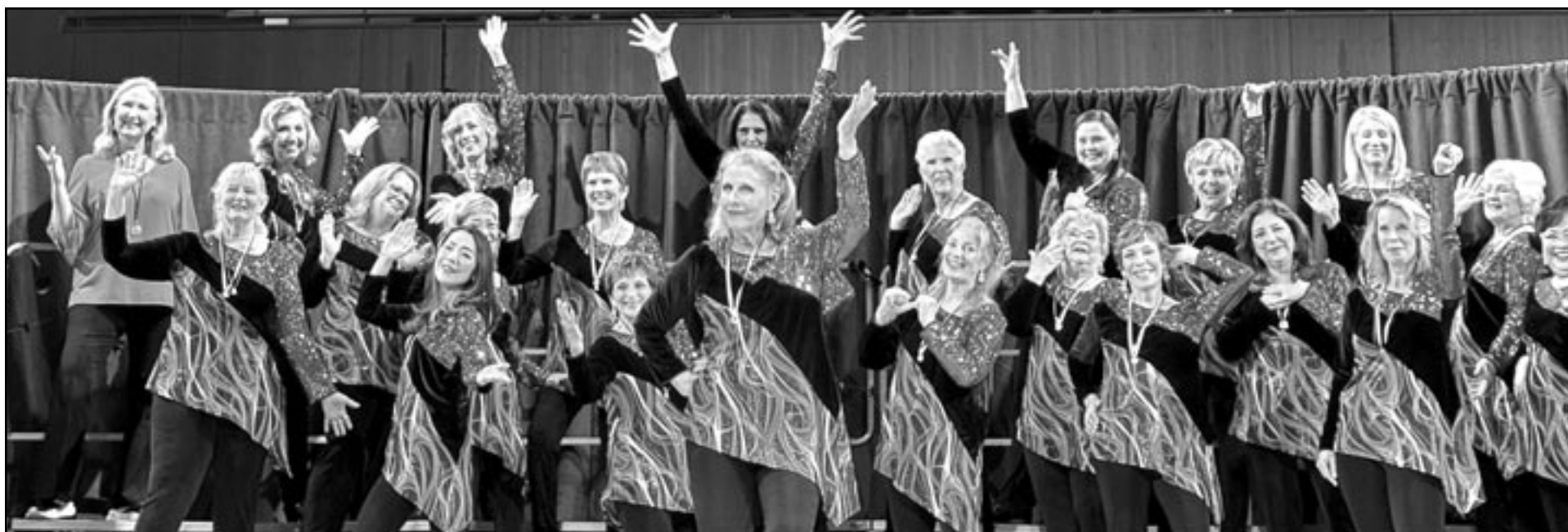
(above) The award-winning Hickory Tree Chorus invites you to join the sisterhood. For details and to schedule your audition, email us at info@hickorytreechorus.org or call 908-377-1399.

For details and to schedule your audition, email us at info@hickorytreechorus.org or call 908-377-1399.