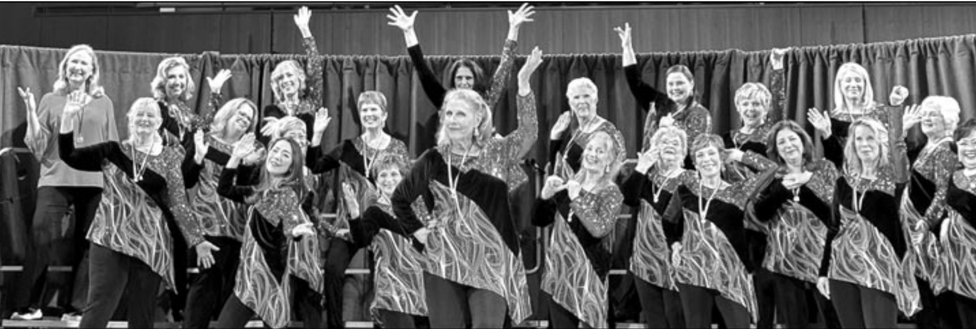
(above) The award-winning Hickory Tree Chorus invites you to join the sisterhood. For details and to schedule your audition, email us at info@hickorytreechorus.org or call 908-377-1399.

For details and to schedule your audition, email us at info@hickorytreechorus.org or call 908-377-1399.