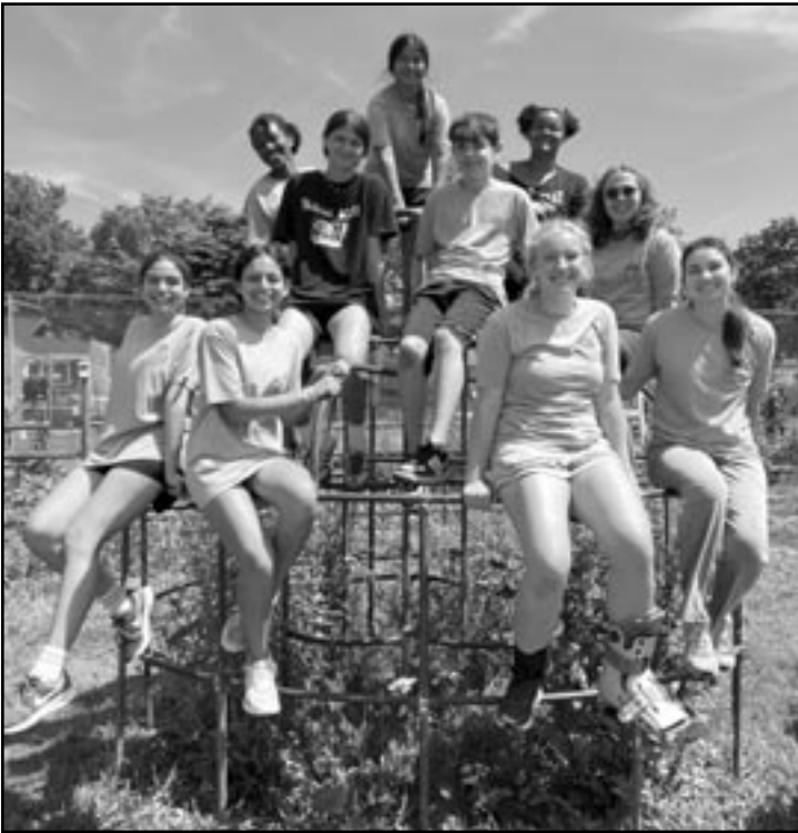
(above) Volunteers from Morristown High School. (below) Farmers and interns

Come visit our team at the Grow It Green Winter Market, starting December 7th. We will be selling our produce once a month, so you can still get a taste of our local harvest. For more info visit: growitgreenmorristown.org