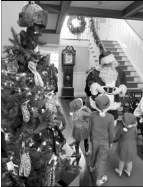
(above) Santa visits with children at Twin Maples beside the Club's Annual Mitten Tree

make it for breakfast, 'Brunch with Santa' will be served each day at 11:15 a.m. All seatings include a children's buffet, adult served meal, photos with Santa, live music and more. This year's beautiful holiday décor features a 'Nutcracker' theme, so don't be surprised to see Clara, the Sugar Plum Fairies and some really naughty mice. Tickets to Santa at Twin Maples can be purchased at https://www.fortnightlyclub.org or through Eventbrite. Seating is limited. Pricing for Breakfast with Santa is $45 for adults and $20 for children under 12. Please bring booster seats for children. Highchairs are not available.