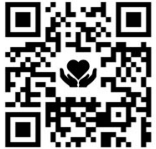
Millburn-Short Hills Volunteer First Aid Squad Neighbors helping neighbors since 1958.

Please consider a fall donation by scanning the QR code here. Together, we can make sure that when help is needed, it's already on the way.