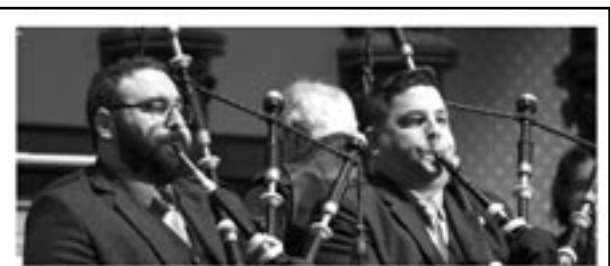
Join Us for the Learned Kindred of Currie's 27th Annual Production

The Learned Kindred of Currie is an international Scottish heritage society dedicated to celebrating Scotland's history, language, and culture. The organization sponsors the annual Pipes of Christmas concerts and a variety of educational programs, including scholarships for young musicians, writers, and scholars.