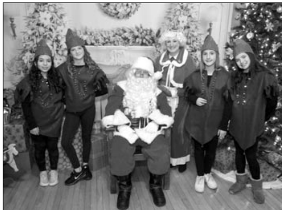
(above) Photo from 2024 celebration.