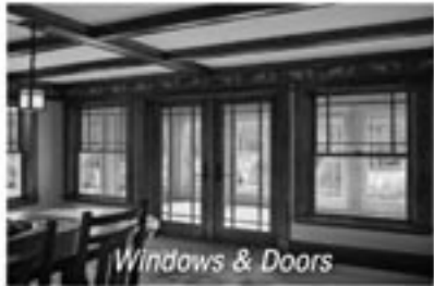
Windows & Doors