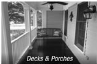
Decks & Porches