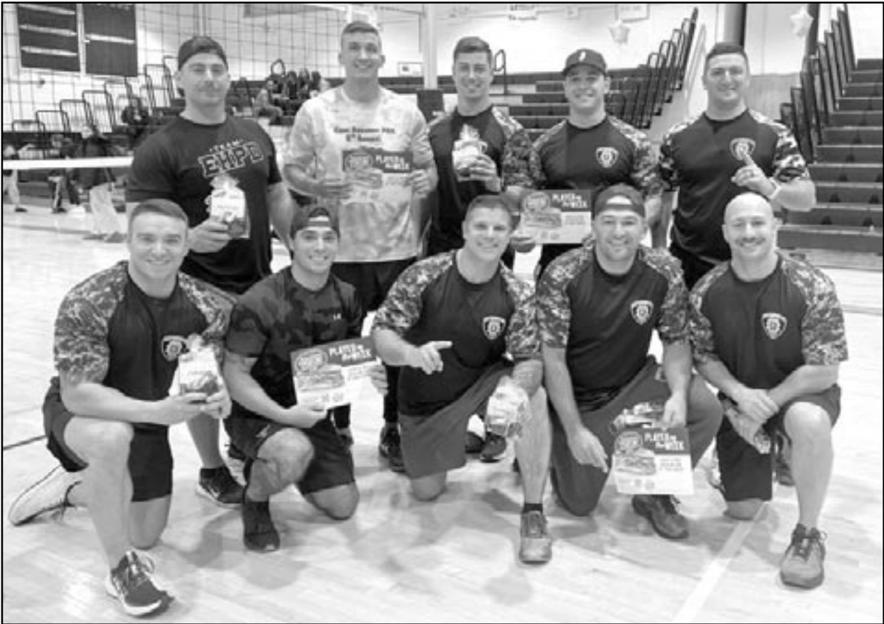
(above) Tournament Champions East Hanover Police Department

community come together for a great night of fun! A special shoutout to our dedicated HP staff who participated and, of course, to the East Hanover Police Department for their support, sportsmanship, and championship win!