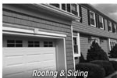
Roofing & Siding