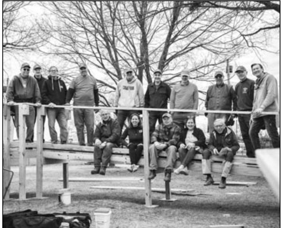
(above) Members of the Handyman Program work to install a large accessibility ramp at a resident's home in Franklin.