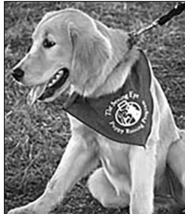
(above) Somerset County 4-H has a wide variety of more than 60 clubs. You don't need to own an animal to join a 4-H animal club.