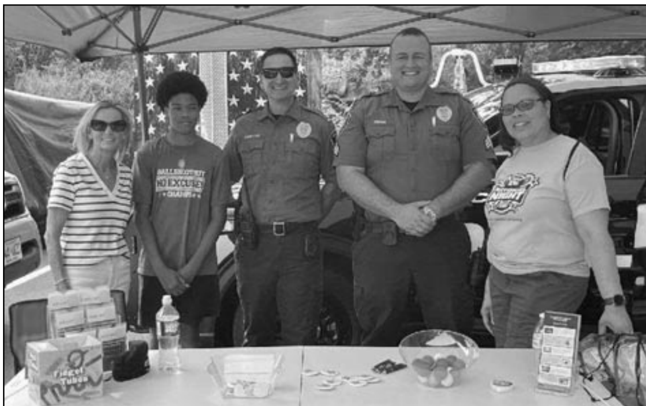
(above) Watchung Hills Regional Municipal Alliance

National Night Out culminates annually on the first Tuesday in August. National Night Out enhances the relationship between neighbors and law enforcement while bringing back a true sense of community. Furthermore, it provides a great opportunity to bring police and neighbors together under positive circumstances. For more information visit natw.org .