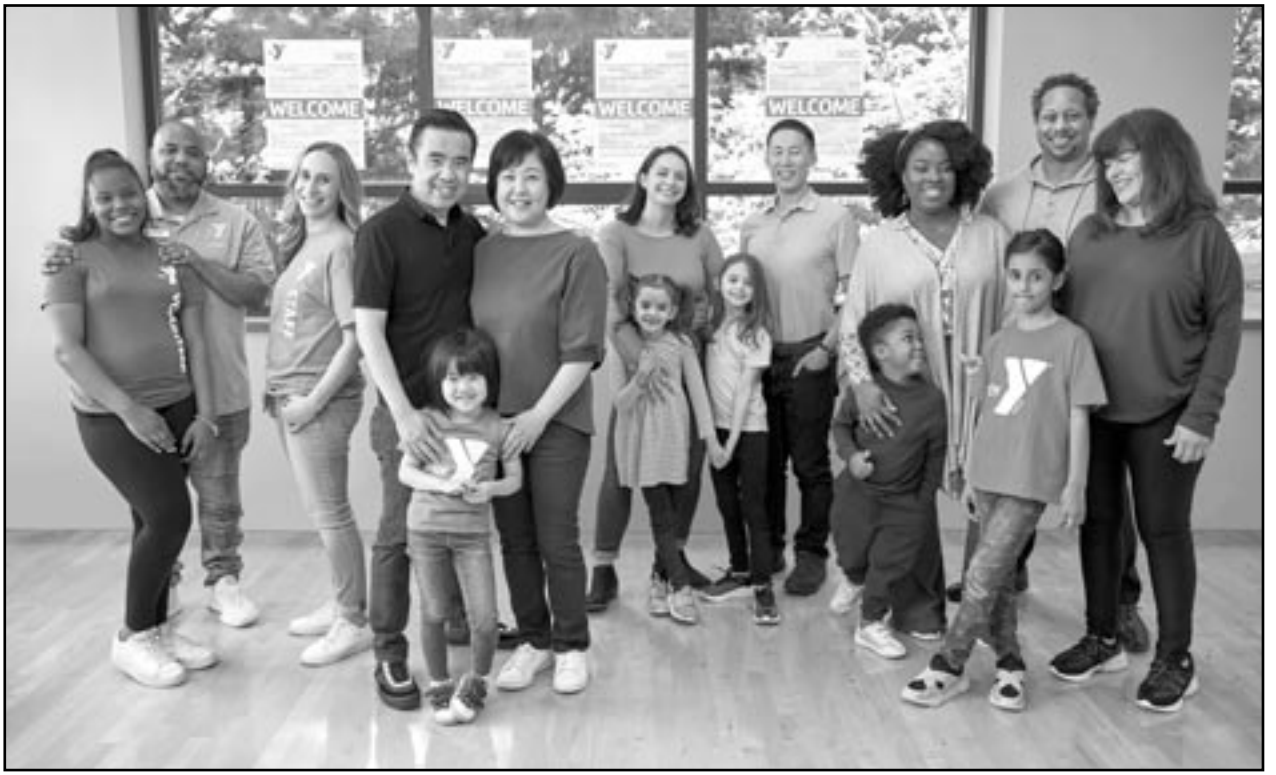
(above) Welcoming Week Celebration takes place at the YMCA September 12-21