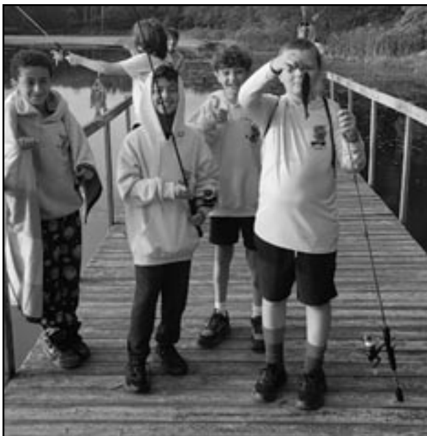
(above) Scouts of Troop 23 on the fishing dock during their annual week-long summer camp in July at Winnebago Scout Reservation.