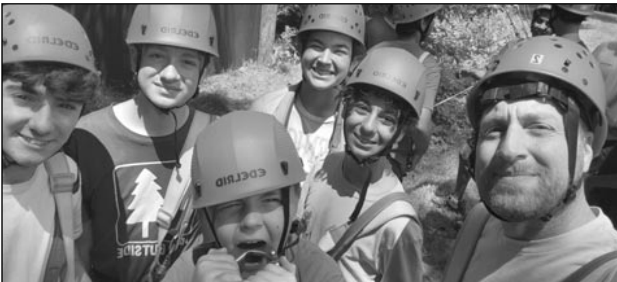
(above) Scouts of Troop 23 are ready to ride the ¼-mile long zip line across Durham Pond.