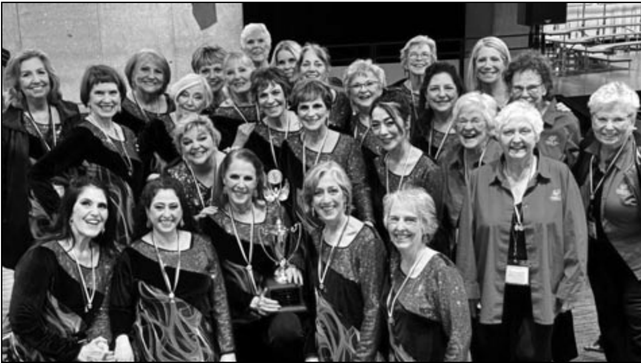
(above) Hickory Tree Chorus, a women's a cappella group, announces September Auditions for a November Show.

harmony sung in the barbershop style. As a chapter of Sweet Adelines International Organization, it has been entertaining audiences in the New Jersey area since 1968. They believe every voice counts and encourage women singers of all ages, ethnicities, and orientations to visit us and share our joy of music. Visit hickorytreechorus.org for more information or call 908-377-1399.