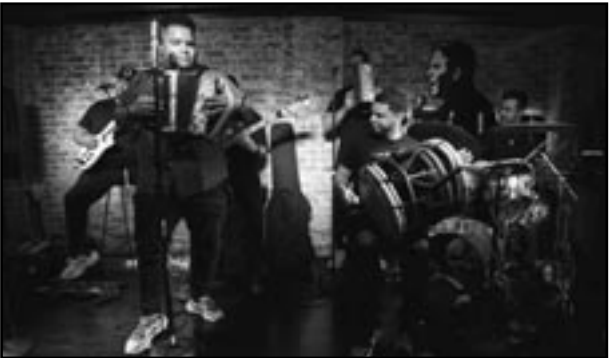
(above) Afro Dominicano

The Multicultural and Heritage Music Festival will bring a wide range of ethnic entertainment to Roselle Park on Saturday, September 27. Presented by the Borough of Roselle Park, Diversity and Inclusion Committee and Greg Johnson Civic Association, the festival will run from noon to 5 pm at Michael Mauri Park on Chestnut Street. It will feature food trucks, a CPR information station, local displays including an exhibit highlighting Roselle Park’s historic railroad system and performers celebrating diverse styles of music from around the world.