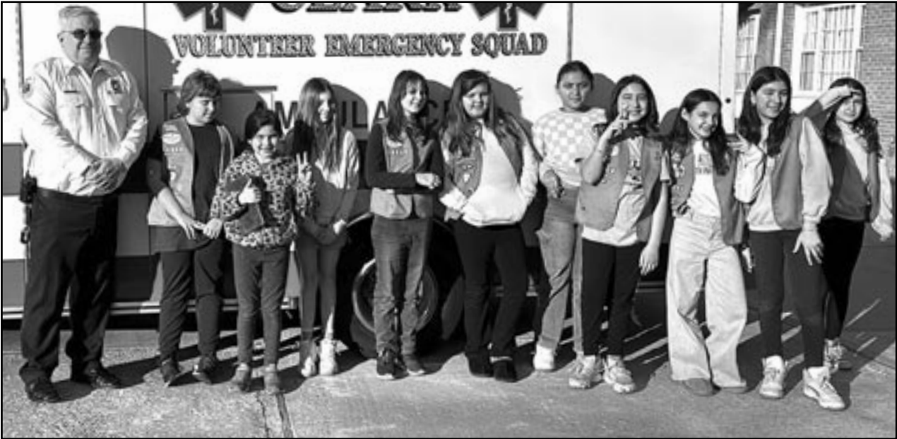
(above) Clark Volunteer Emergency Squad Hosted Girl Scouts.

If anyone is interested in bringing a group to CVES to learn more about what we do, you are encouraged to email us at cves@ourclark.com Additionally, CVES is always looking for people who have the desire to help others whether you have experience or not. The squad will train and mentor you through the certification process. Being an EMT is a wonderful way to give back to your community. Please visit us at ourclark.com/325/Join-Us for an application or email us at CVES@ourclark.com with questions or for more information.