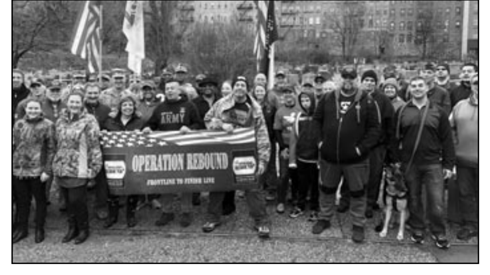
(above) NJVN Memorial Day parade march.

Our approach, combined with the ability to collaborate with other organizations that share our mission, has allowed us to save lives and help veterans live a better quality of life. Recently, the NJVN has ramped up our mentorship and peer