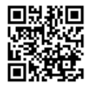
Find us on online: rennamedia.com facebook.com/ Berkeley Heights News