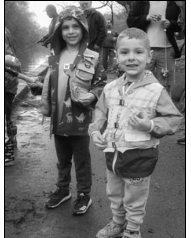
(above) The Newark Bait and Fly casting Club Annual Youth Fishing Derby will be held on Saturday, April 12, 2025 at Echo Lake Park in Westfield, NJ. - Photo from 2019 Derby