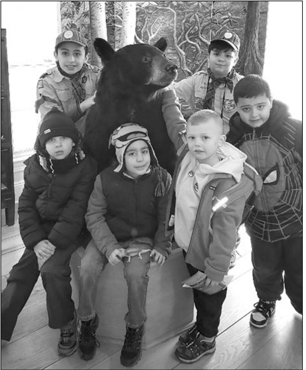
(above) The Cub Scouts of Pack 23 visited the Great Swamp National Wildlife Refuge on March 8, and took a picture with a black bear in the Helen C. Fenske Visitor Center.