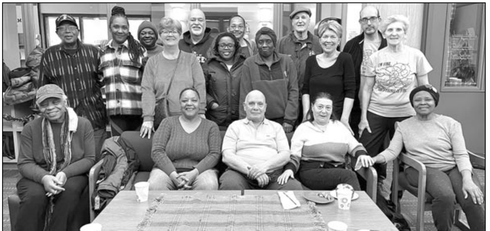
(above) During the free 12-week course, classes will focus on balance, nutrition, tai-chi, mental health, working out with tension bands, stretching and the circuit course, as well as other weight machines. Small group discussions will build bonds and provide support.

*****ECRWSSDDM***** POSTAL PATRON UNION, NJ 07083