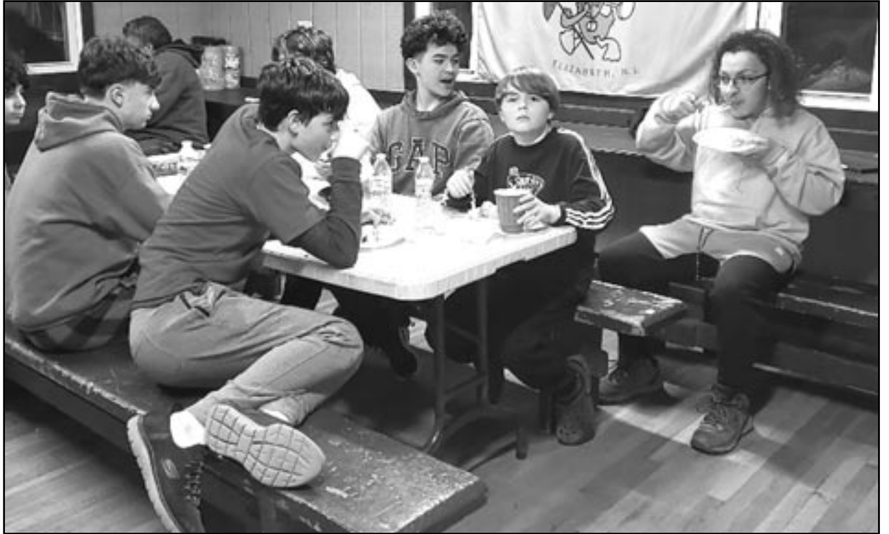
(above) Scouts of Troop 23, Elizabeth, enjoy the hot dinner they cooked on a cold weekend in February in Beech Cabin in William H. Pouch Scout Camp on Staten Island.