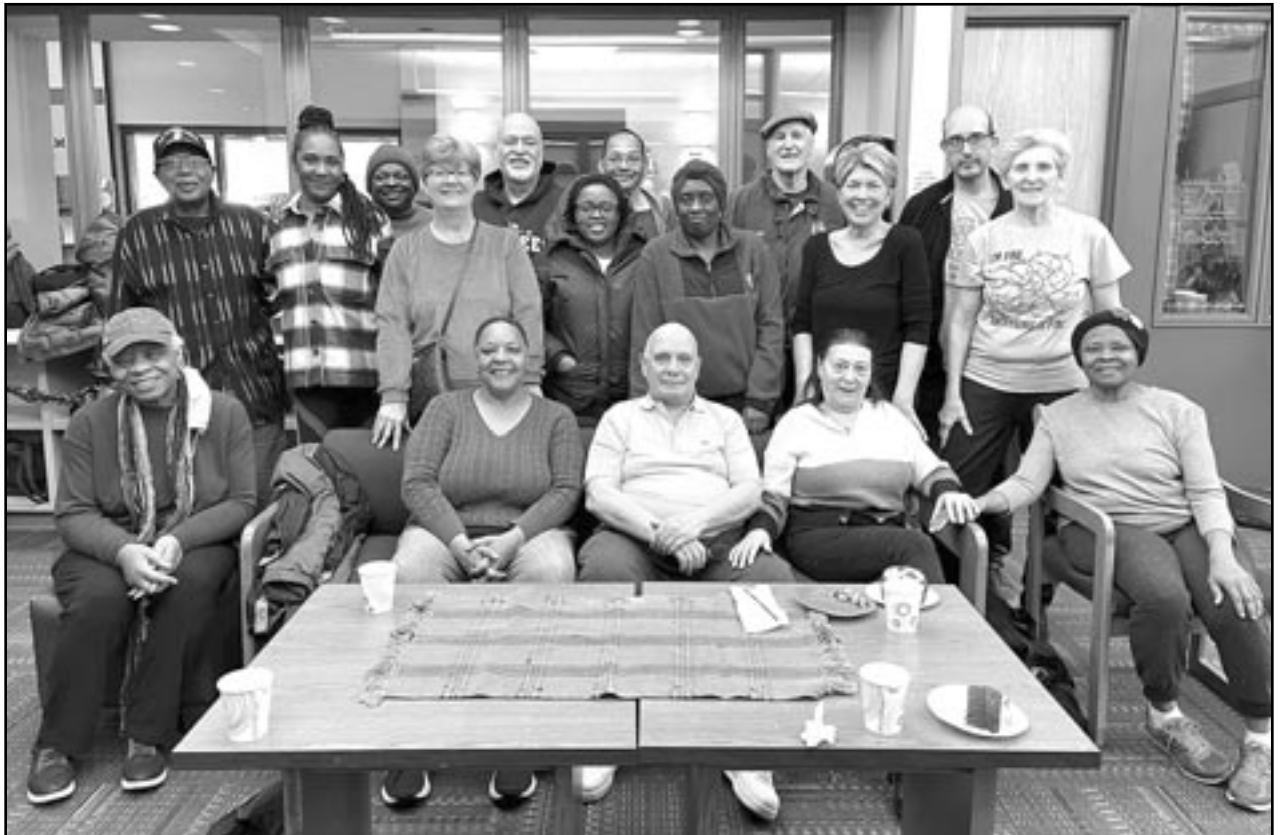
(above) During the free 12-week course, classes will focus on balance, nutrition, tai-chi, mental health, working out with tension bands, stretching and the circuit course, as well as other weight machines. Small group discussions will build bonds and provide support.

To learn more about The Gateway Family YMCA, visit tgfymca.org or contact the Wellness Center Branch 908-349-9622 for more information.