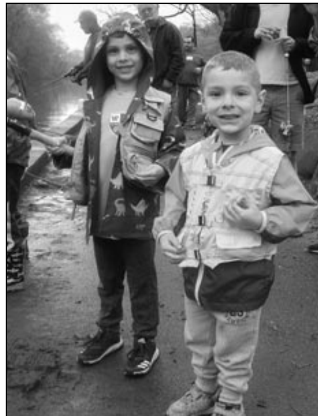
(above) The Newark Bait and Fly casting Club Annual Youth Fishing Derby will be held on Saturday, April 12, 2025 at Echo Lake Park in Westfield, NJ. - Photo from 2019 Derby