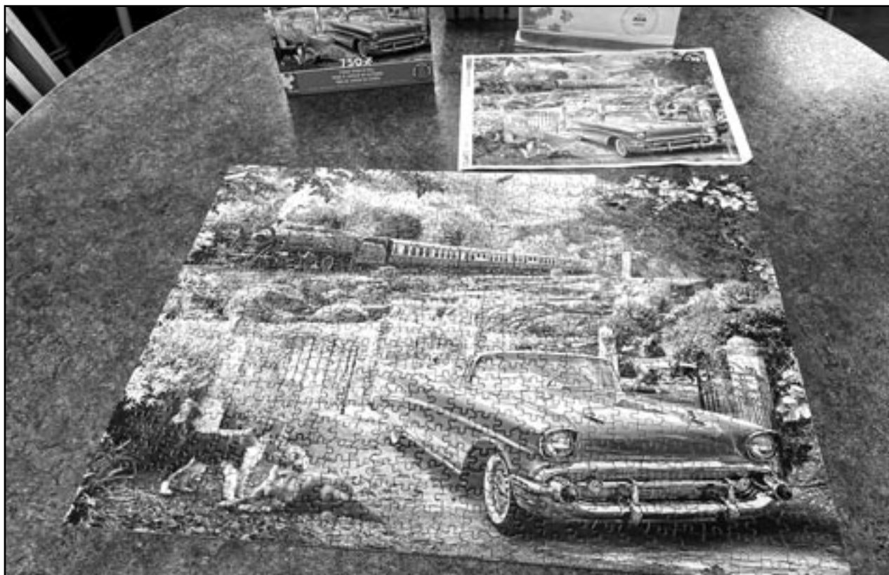
(above) Another beautiful puzzle completed by our amazing patrons! There's nothing like the satisfaction of placing that final piece. Stop by downstairs (adult section) relax and join in on the next one!