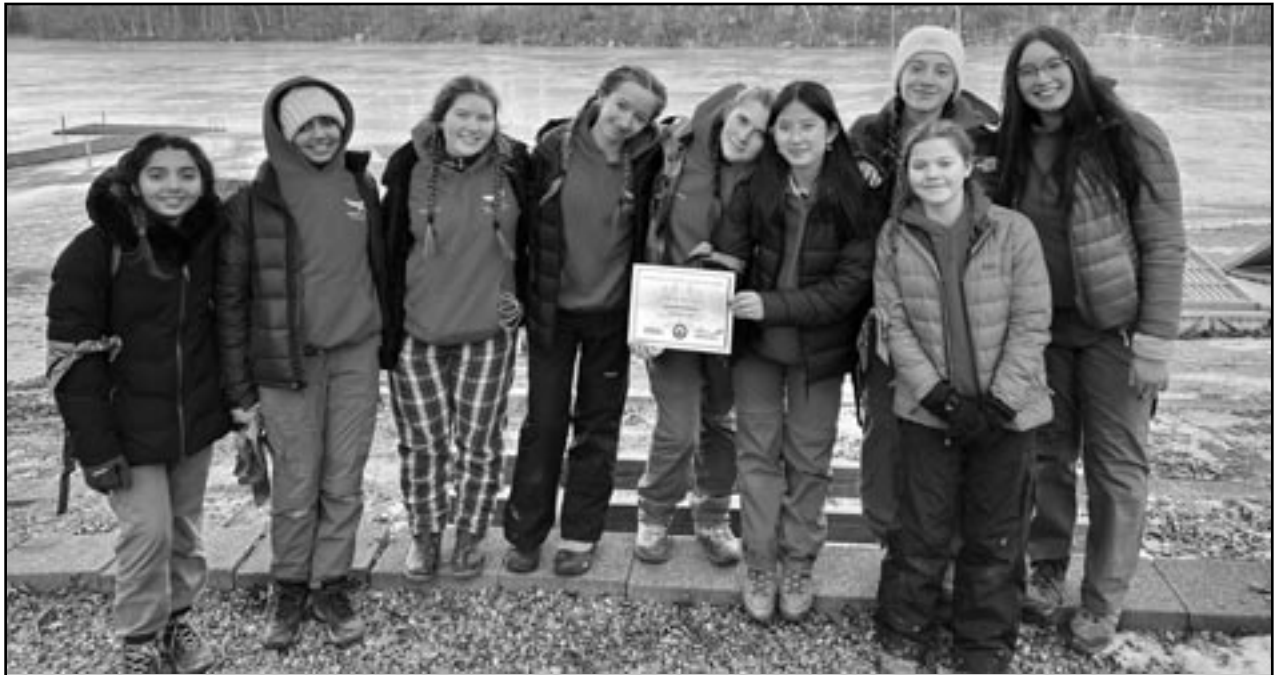
(above) For more information on Troop 280, which is a troop of girls from the towns of Summit, New Providence, Berkeley Heights, Basking Ridge, Madison, the Chathams, and other neighboring communities, please visit their website: scoutsbsa280.org ; and Facebook page: facebook.com/ChathamT280 .

The victory also highlights the strength of the BSA's values, emphasizing leadership, citizenship, and outdoor skills, while