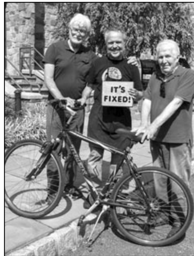
(above) Madison Rotary, Grace Church, and Repair Café will team up for a free "Repair, Reuse, and Recycle" event on April 12

This event is a follow-up to our first two, very successful, Repair Cafes in Madison. Our volunteers and our visitors came from Madison and many surrounding towns. We had over 200 items brought in for repair and we