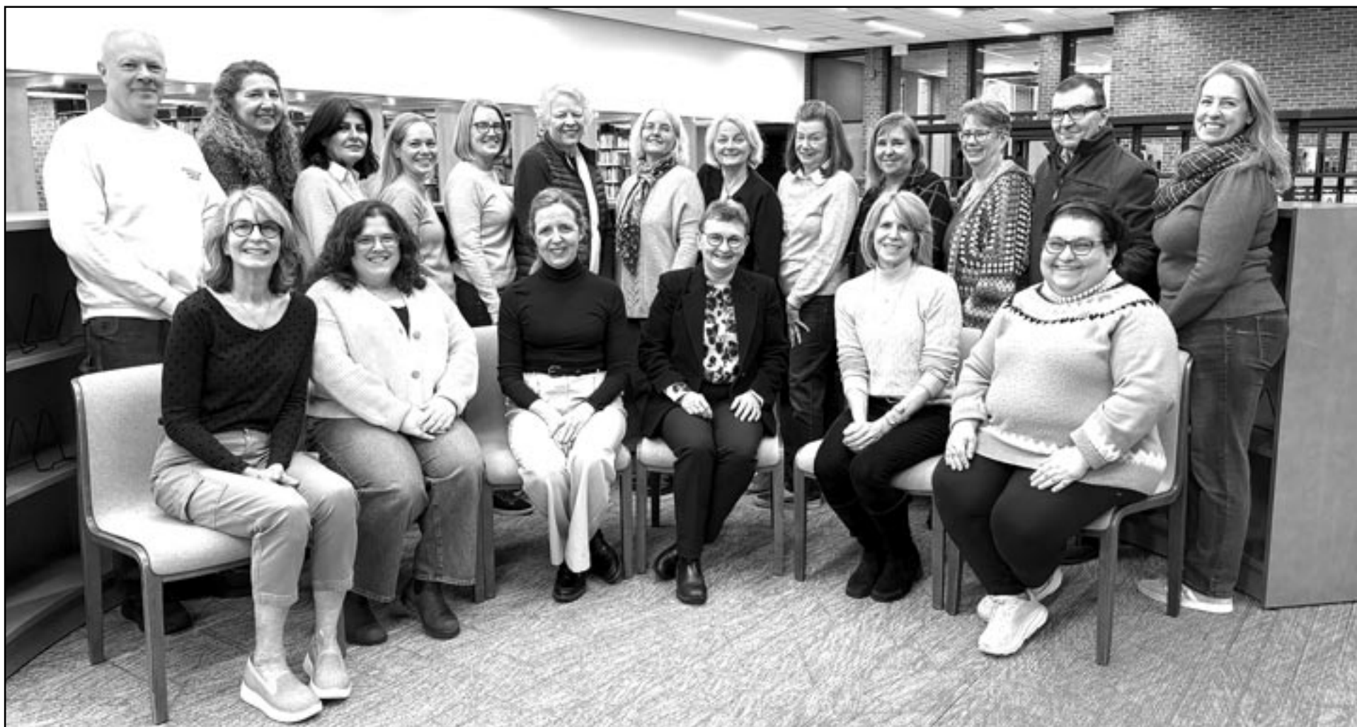
(above) Madison Public Library staff members.

Invitations are being sent to library donors and are also available at the library's Chase Room front desk. For more information about the 2025 Annual Benefit and reservations or about the Friends of the Madison Public Library, please visit friendsmadisonnjlibrary.org .