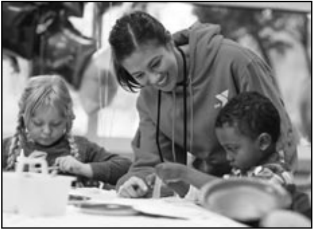
(above) The Gateway Family YMCA Sets Kids Up for a Safe, Healthy and Fun Summer at Healthy Kids Day. The free family event is open to the community on April 26.

The Gateway Family YMCA is a 501(c)(3) non-profit, health and community service organization of caring staff and volunteers dedicated to strengthening community through Youth Development, Healthy Living and Social Responsibility. The Gateway Family YMCA impacts the community by providing quality services for all. The Y doesn’t just strengthen bodies – it strengthens people, families and communities.