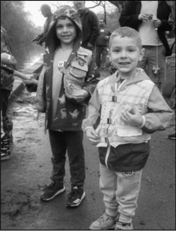
(above) The Newark Bait and Fly casting Club Annual Youth Fishing Derby will be held on Saturday, April 12, 2025 at Echo Lake Park in Westfield, NJ. - Photo from 2019 Derby