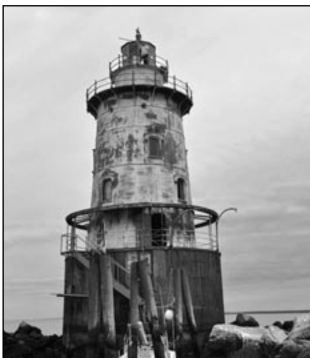
(above) Stamford Harbor Lighthouse maritime beacon and wildlife den.