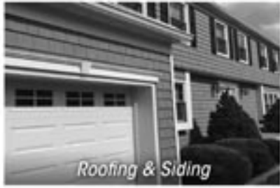
Roofing & Siding