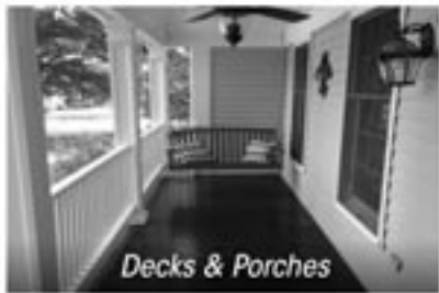
Decks & Porches