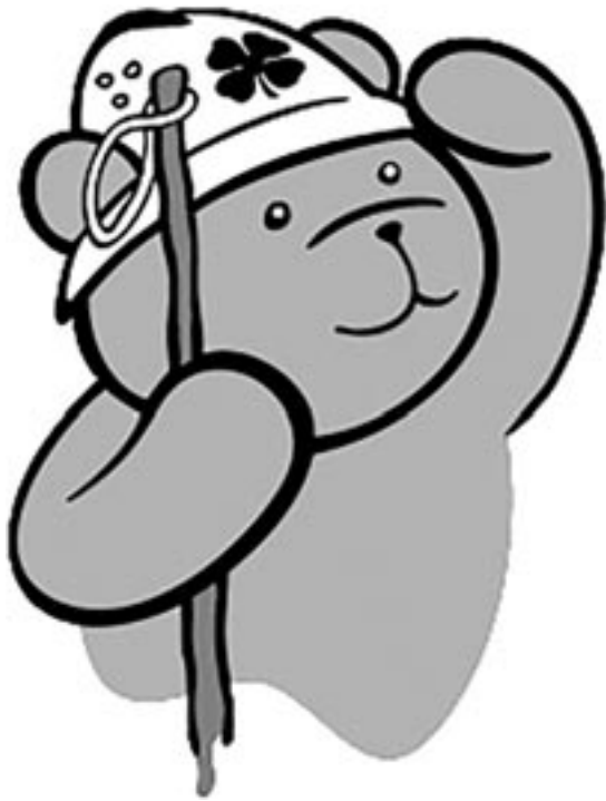
(above) 4-H Prep offers fun, interactive learning opportunities for youngsters in grades K-3.

4-H is the Youth Development Program of our nation's Cooperative Extension System and is one of America's oldest and largest youth organizations with six million members. 4-H empowers young people K-13 (one year out of high school) with the skills that they need to succeed in life. To join 4-H or learn more, visit 4HisTOPS.org.