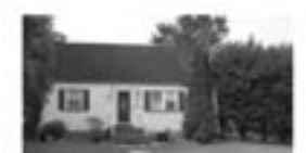
255 FAITOUTE AVE KENILWORTH, NJ