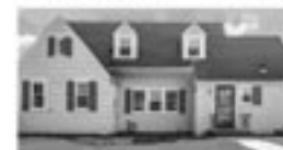
464 EUCLID AVE. UNION, NJ