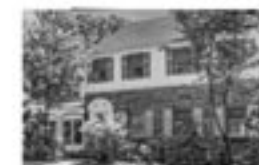
1500 CHARLOTTE RD PLAINFIELD, NJ