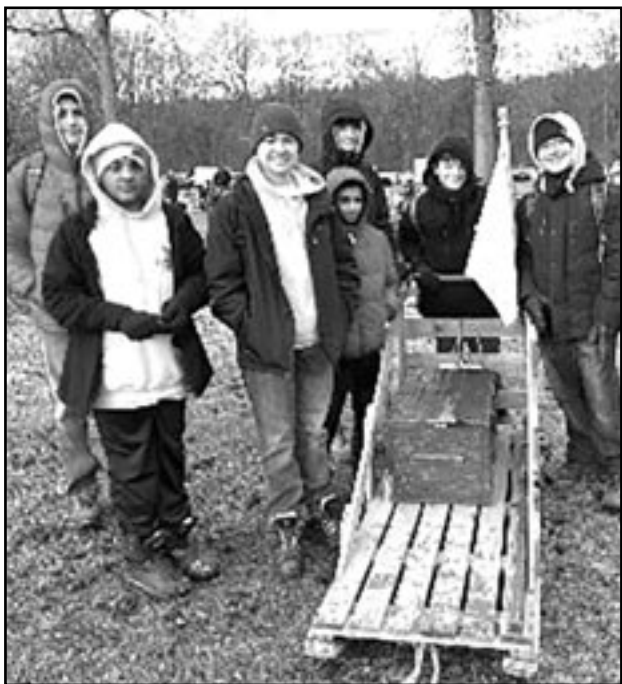
(above) The Scouts of Troop 23's Flaming Arrow Patrol pulled their sled to 7 locations in the Watchung Reservation to earn 102 gold nuggets in the Klondike derby.