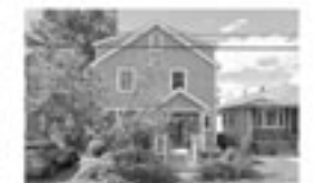
316 HAZEL AVE GARWOOD, NJ