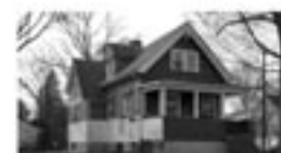
45 HARRISON AVE PLAINFIELD, NJ