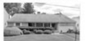
331 N. 19TH STREET KENILWORTH, NJ