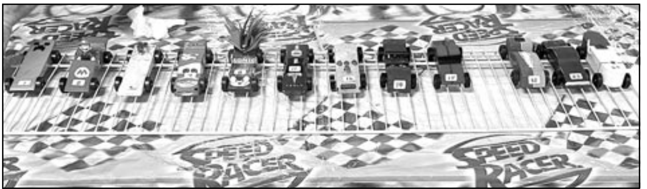
(above) The Cub Scouts of Pack 23 at St. Genevieve's Church built racing cars out of blocks of wood and raced against each other on February 7 at the exciting annual Pinewood Derby.