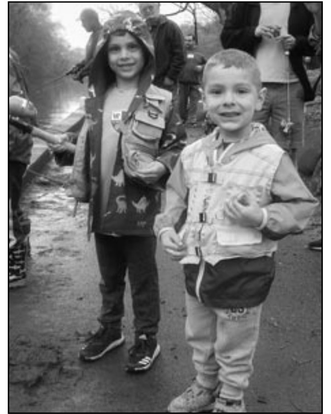
(above) The Newark Bait and Fly casting Club Annual Youth Fishing Derby will be held on Saturday, April 12, 2025 at Echo Lake Park in Westfield, NJ. - Photo from 2019 Derby