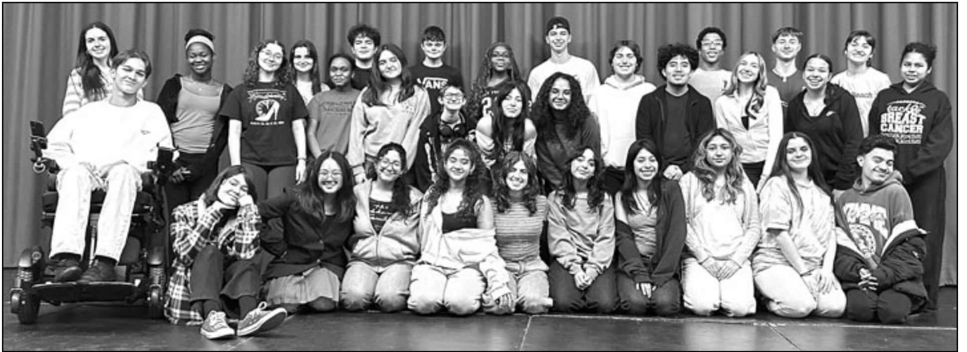
(above) Get Ready for a Spellbinding Experience as Roselle Park High School Theatre Presents Roald Dahl's Matilda the Musical.