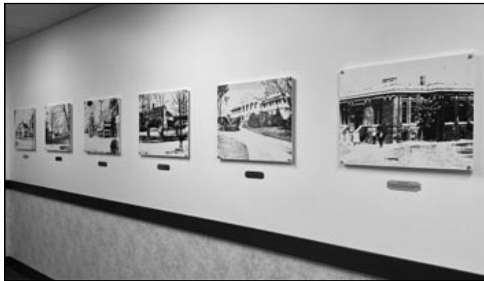
(above) Historical photos of early downtown Mountainside line the walls at Borough Hall during the unveiling of this new photo exhibit.