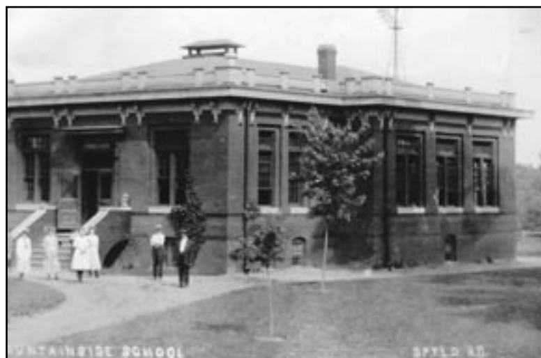
(above) Mountainside Red Brick School