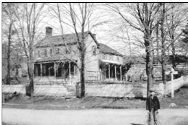
(above) Early Levi Cory House

The Mountainside Restoration Committee is a committee of volunteers whose purpose is to restore and maintain the Deacon Andrew Hetfield House and the Levi Cory House and collect and save historical information and items from destruction. For information on the Mountainside Restoration Committee events or to donate funds, please call 908-233-3135; or visit: mountainsidehistory.org