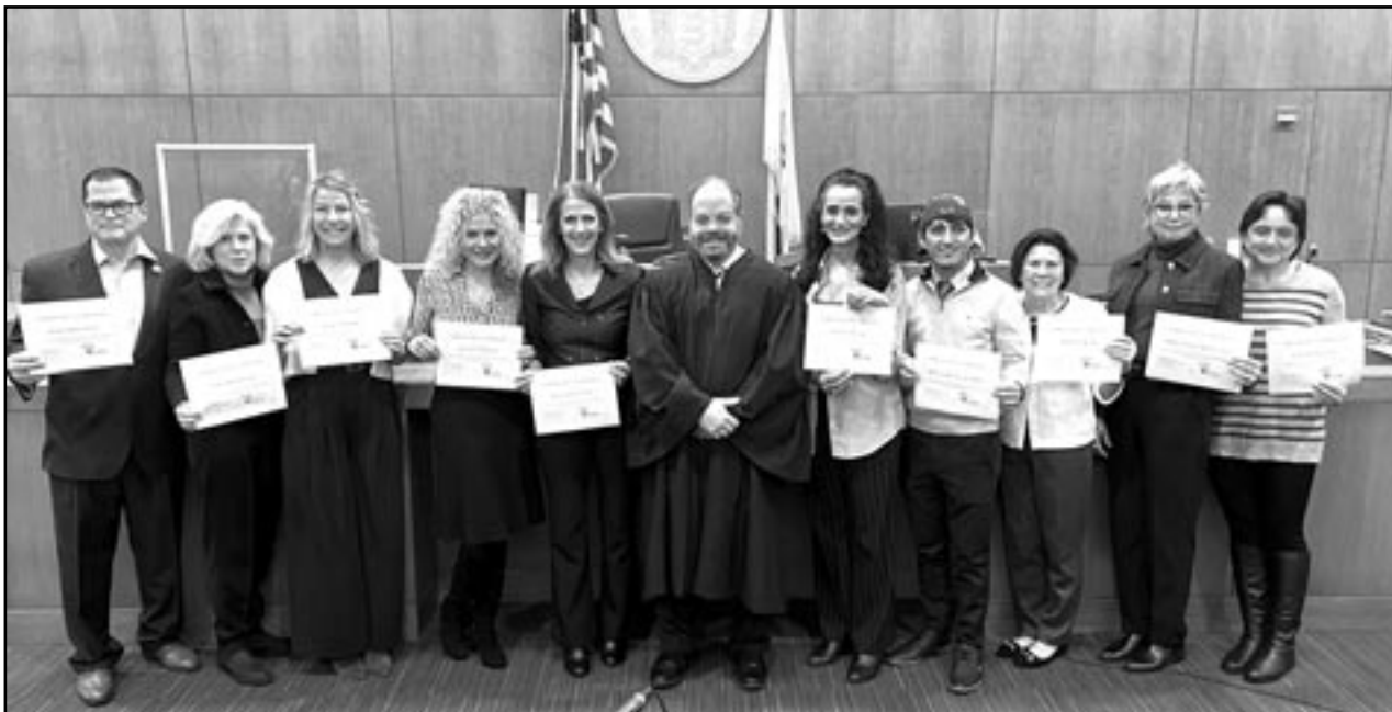
(above) Union County Superior Court Judge Gavin I. Handwerker presided over the swearing-in of 12 volunteers who trained with Court Appointed Special Advocates (CASA) of Passaic and Union Counties to advocate for vulnerable children in foster care.

CASA of Passaic and Union Counties is a program of Child Focus, which prioritizes the needs and well-being of infants, children, and teens impacted by, or at risk of, abuse or neglect. For details about the CASA program, call 973-832-4002, e-mail info@casapassaicunion.org , or visit www.casapassaicunion.org .