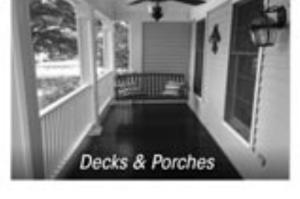
Decks & Porches