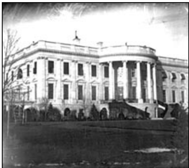
(above) Earliest known photo of the White House, 1846.