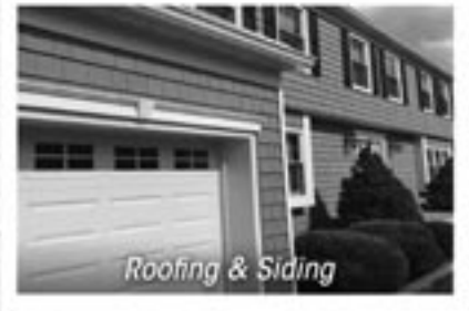
Roofing & Siding