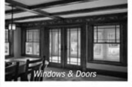
Windows & Doors