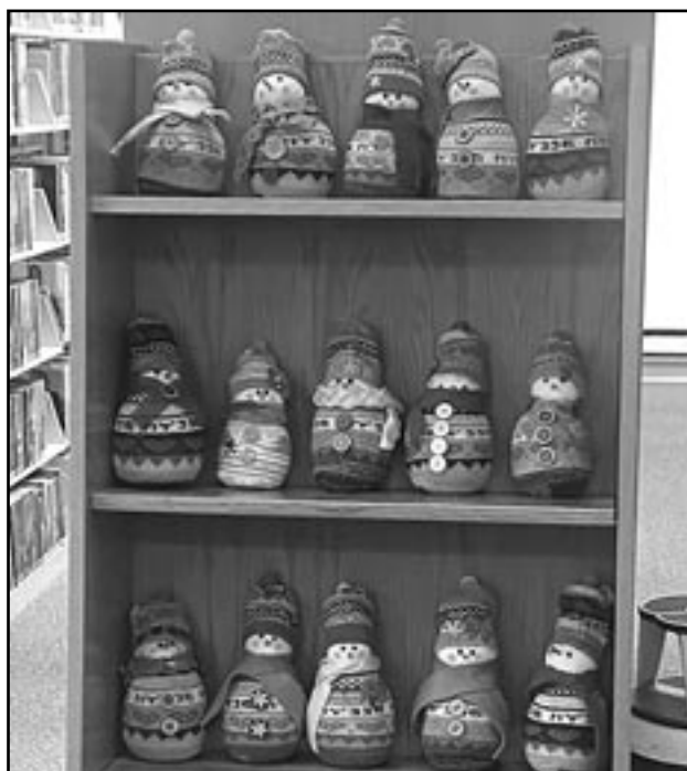
(above) In February Library patrons created snowpeople out of materials found in the Dollar Store.

To register, go to the Whippanong Library event page at whippanong.org/events-calendar