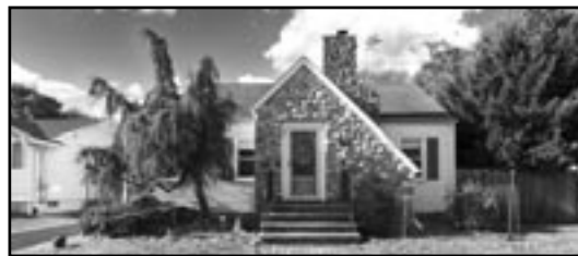
FOR SALE 103 Cramer Avenue, Green Brook 3 Bed / 2 Bath / 2 Car Garage