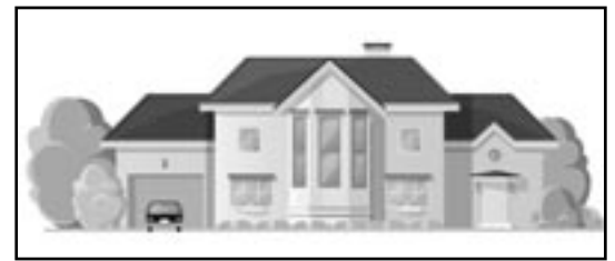
COMING SOON in Watchung 4 Bed / 2 Bath / 2 Car Garage