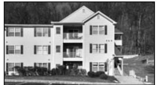
SOLD 2/26 1036 King Ct, Green Brook Listed by Roseann