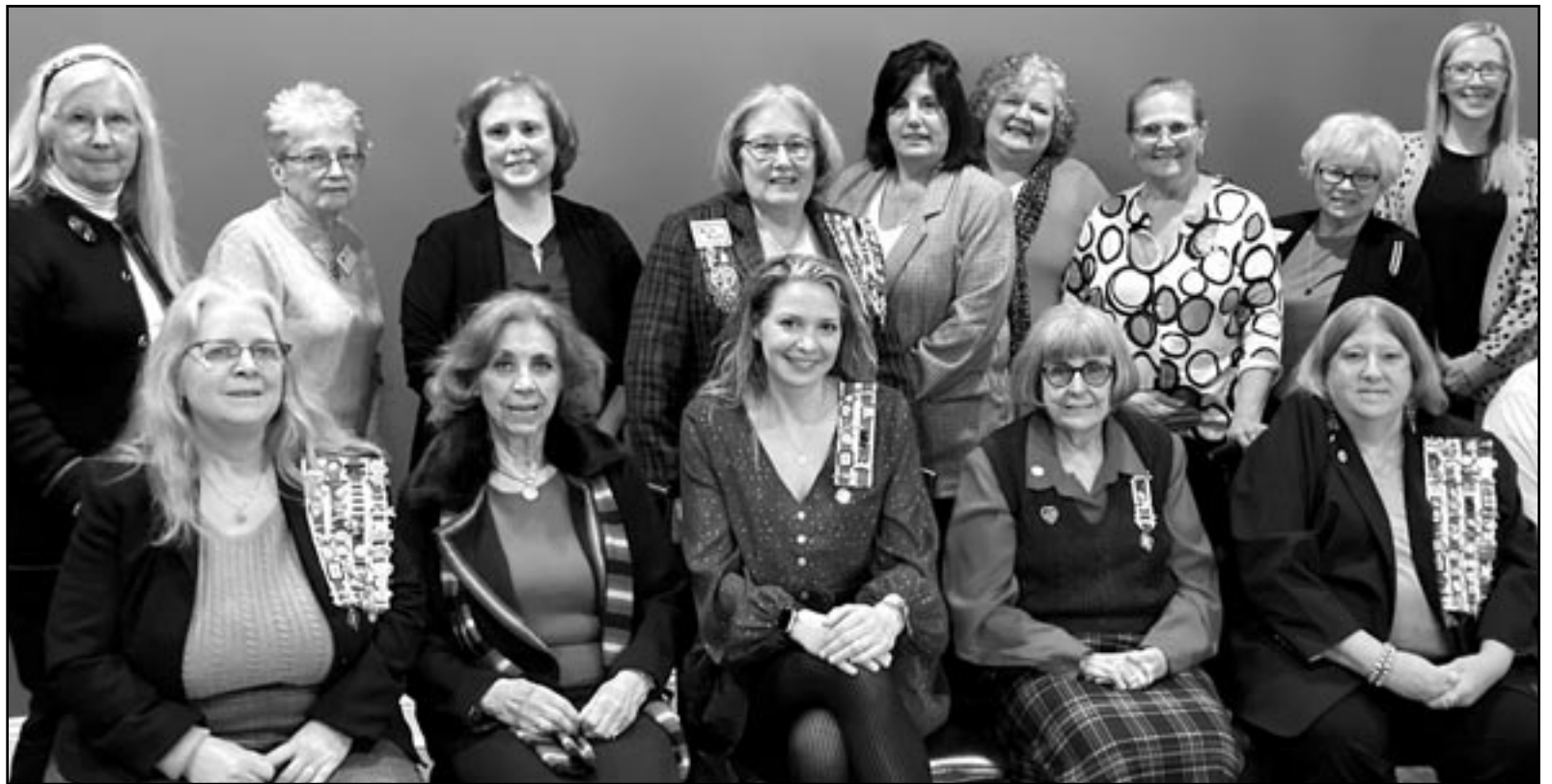
(above) The DAR Winter Meeting and Luncheon celebrated chapter achievements of the past year.

DO YOU KNOW HOW MUCH YOUR HOME IS WORTH? THERE HAS NEVER BEEN A BETTER TIME TO $ELL!