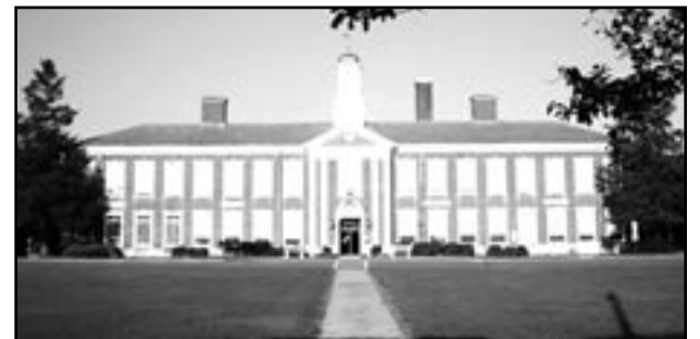
(above) Ridgedale Middle School has earned the honorable distinction of being a nationally recognized School to Watch from the National Forum, which runs the program.