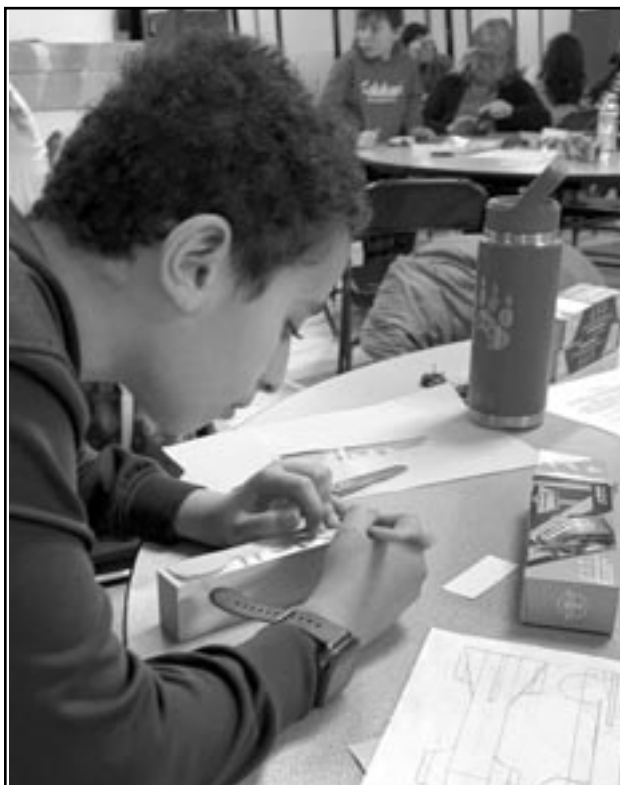
(above) Cub Scouts from Pack 23 are transforming blocks of wood into race cars for their annual Pinewood Derby.