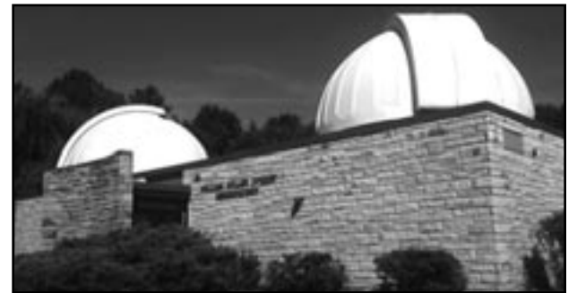
(above) AAI has always interested anyone who loves looking and learning about the night sky.

Saturday, May 17, 2025. The event will be held in 2 locations: Trailside Nature & Science Center in Mountainside in the afternoon and at William Miller Sperry Observatory on the campus of Union College in Cranford in the evening. The theme is "Solar Max, Unlocking the Secrets of the Sun." This is a family friendly event that focuses on learning about our Sun and its impact on us, and also about astronomy and related sciences in a fun and easy to understand atmosphere. This event appeals to both children and adults. The event is free and open to the public and does not require preregistration. So, mark your calendars for Saturday, May 17, 2025, and come out to learn more about the Sun and our universe!