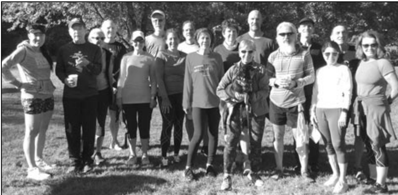
(above) A recent Rose City Runners club run.