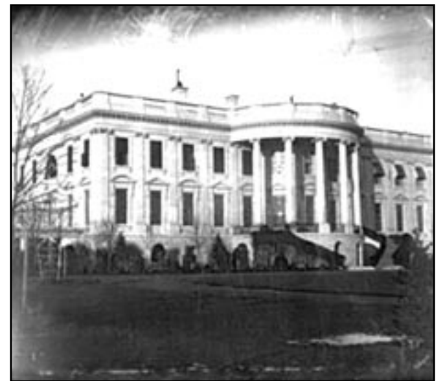
(above) Earliest known photo of the White House, 1846.