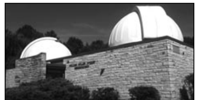
(above) AAI has always interested anyone who loves learning about the night sky. Housed in the William Miller Sperry Observatory on the Union College campus in Cranford, the observatory is open to the public every Friday nights. One of the domes houses a 24-inch reflector and the other dome houses a 10 refractor,. Public lectures start at 8:30 p.m. on Fridays, on current topics in Astronomy.

Amateur Astronomers, Inc. along with the North Jersey Astronomical Group, two amateur astronomy clubs located in New Jersey, are once again holding their annual Astronomy Day on Saturday, May 17, 2025. The event will be held in 2 locations: Trailside Nature & Science Center in Mountainside in the afternoon and at William Miller Sperry Observatory on the campus of Union College in Cranford in the evening. The theme is "Solar Max, Unlocking the Secrets of the Sun." This is a family friendly event that focuses on learning about our Sun and its impact on us, and also about astronomy and related sciences in a fun and easy to understand atmosphere. This event appeals to both children and adults. The event is free and open to the public and does not require preregistration. So, mark your calendars for Saturday, May 17, 2025, and come out to learn more about the Sun and our universe!