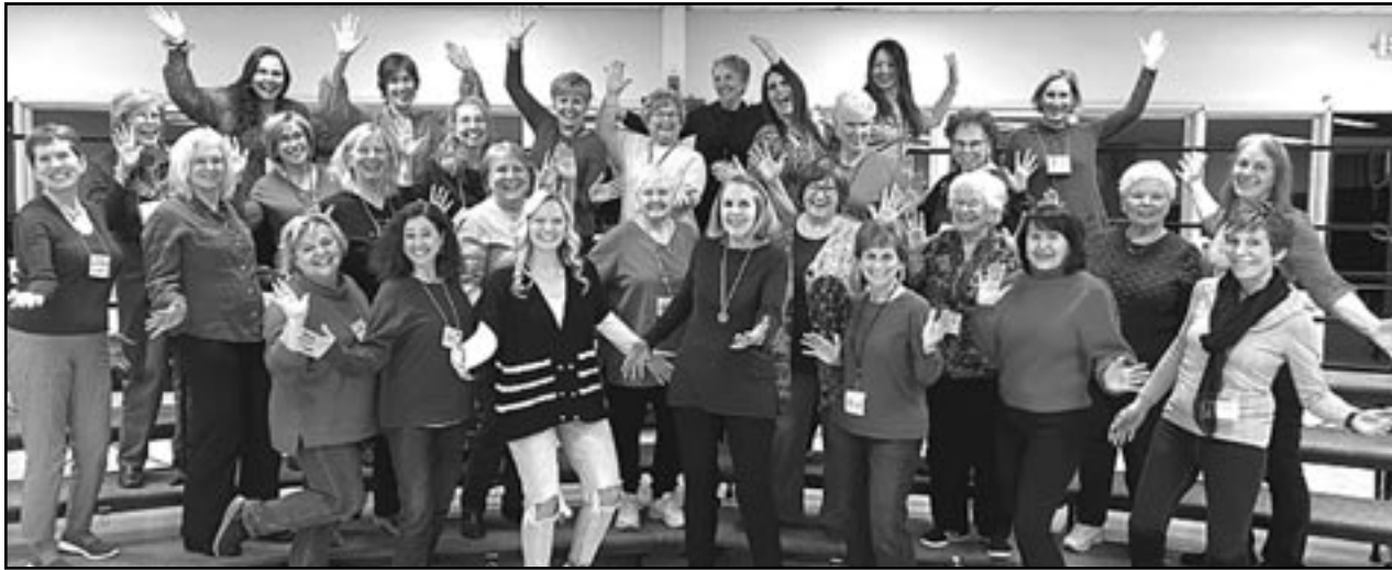
(above) The Hickory Tree award-winning women's chorus is hosting free events on January 8 and 15, 2025, from 6:45 to 9:30 p.m. at The Shrine of St Joseph, 1050 Long Hill Road, Stirling, NJ.

Please contact the Chorus for the Winter Sing-Along by email at info@hickorytreechorus.org . Find more information at hickorytreechorus.org .