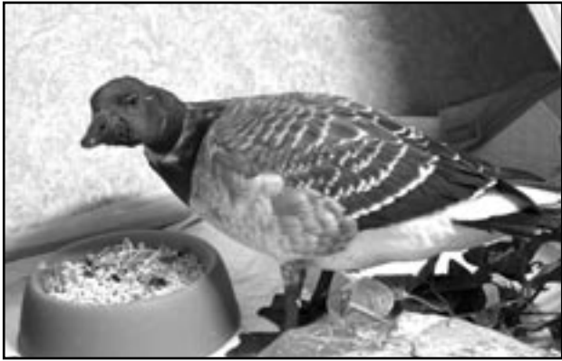
(above) We're thrilled to see this Brant goose take to the skies (or water) once more! It was a charming patient.

The Raptor Trust is a 501(c)3 non-profit organization located at 1390 White Bridge Rd., Millington, NJ. They provide free care and assistance to injured, sick, or orphaned wild birds. They offer educational programs to the public about wild birds, especially birds of prey. They strive to provide a human example for others. For more information about upcoming events, to make a donation, and volunteer opportunities visit info@theraptortrust.org . To report an injured wild bird call 908-647-2353.