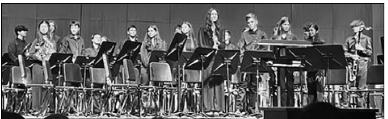
(above) The Winter Instrumental Concert featured the incredible talent and teamwork of Watchung Hills Regional High School students while fostering a sense of togetherness and holiday cheer.