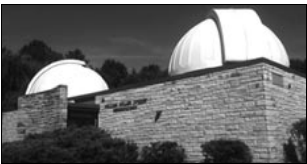
(above) AAI has always interested anyone who loves learning about the night sky. Housed in the William Miller Sperry Observatory on the Union College campus in Cranford, the observatory is open to the public every Friday nights. One of the domes houses a 24-inch reflector and the other dome houses a refractor. Public lectures start at 8:30 p.m. on Fridays, on current topics in Astronomy.

Amateur Astronomers, Inc. along with the North Jersey Astronomical Group, two amateur astronomy clubs located in New Jersey, are once again holding their annual Astronomy Day on Saturday, May 17, 2025. The event will be held in 2 locations: Trailside Nature & Science Center in Mountainside in the afternoon and at William Miller Sperry Observatory on the campus of Union College in Cranford in the evening. The theme is "Solar Max, Unlocking the Secrets of the Sun." This is a family friendly event that focuses on learning about our Sun and its impact on us, and also about astronomy and related sciences in a fun and easy to understand atmosphere. This event appeals to both children and adults. The event is free and open to the public and does not require preregistration. So, mark your calendars for Saturday, May 17, 2025, and come out to learn more about the Sun and our universe!