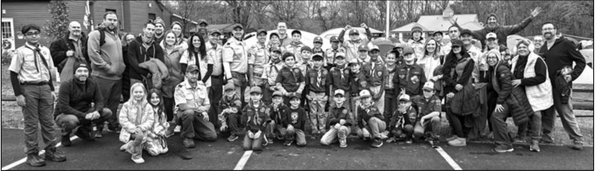
(above) Warren Cub Scouts stayed in a campground in Annapolis, Maryland, joining over 500+ other scout packs from across the northeast.