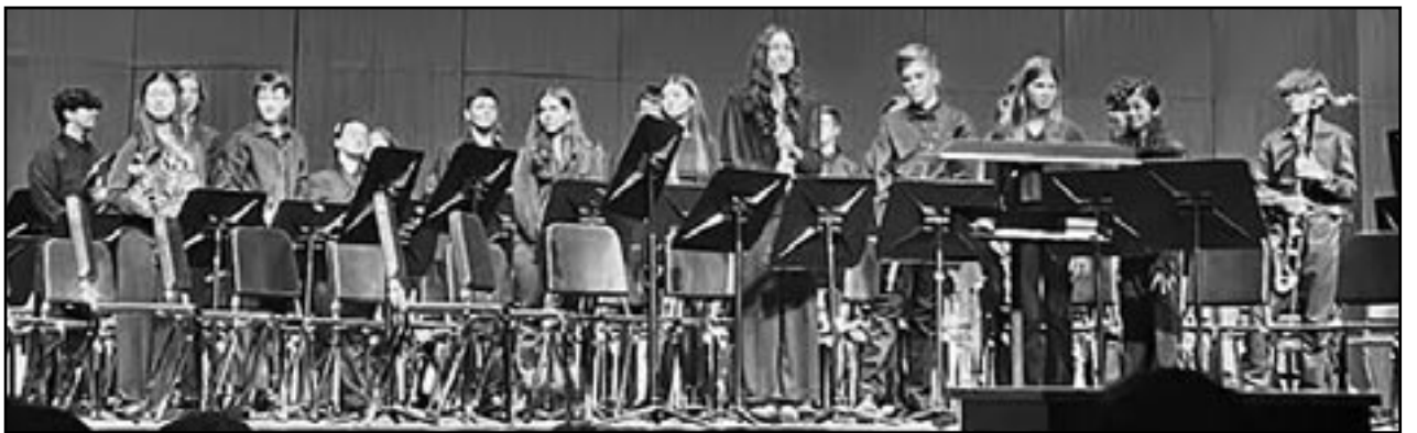
(above) The Winter Instrumental Concert featured the incredible talent and teamwork of Watchung Hills Regional High School students while fostering a sense of togetherness and holiday cheer.