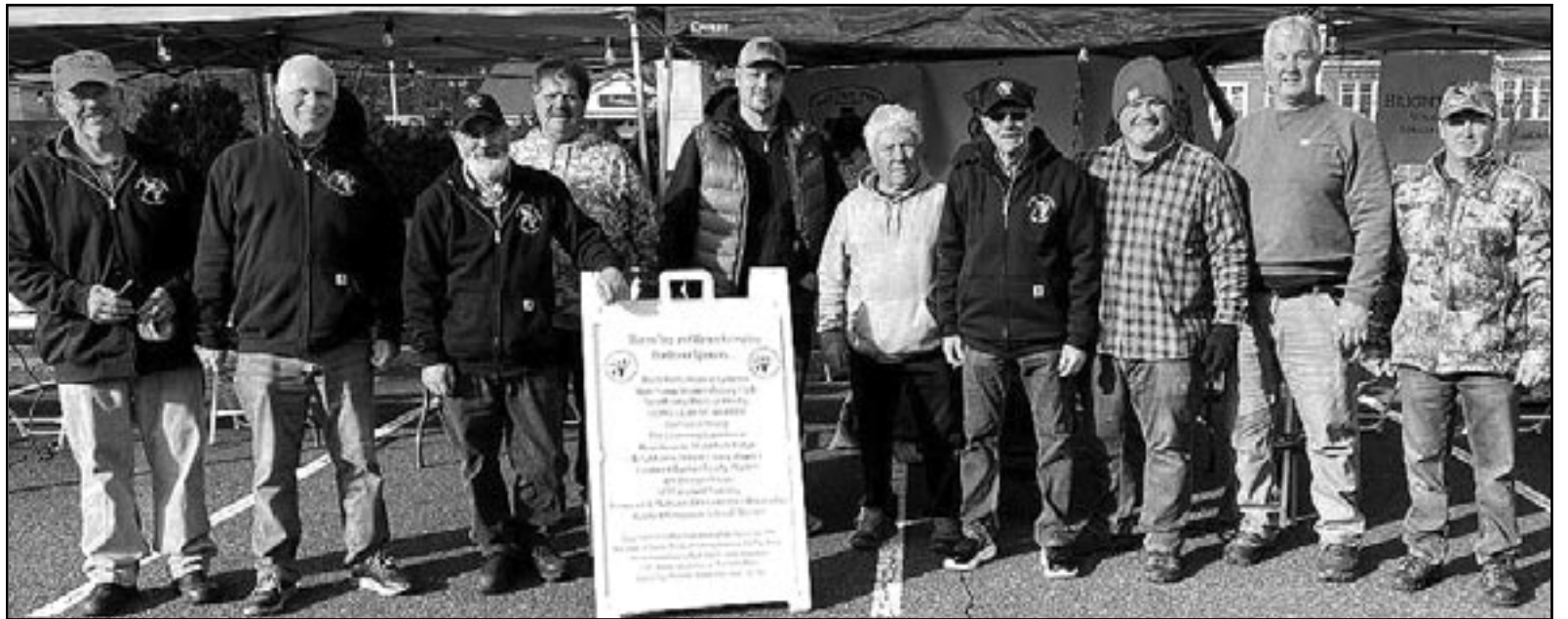
(above) Warren Township Recreation issued a special thank you to the Warren Blue Ridge Sportsmen for all their help in setting up, and the breaking down of the event.

chocolate, and a bonfire and fireworks. Food was for sale by a variety of food trucks. A tree lighting ceremony was held, and Santa made a special visit and posed for pictures.