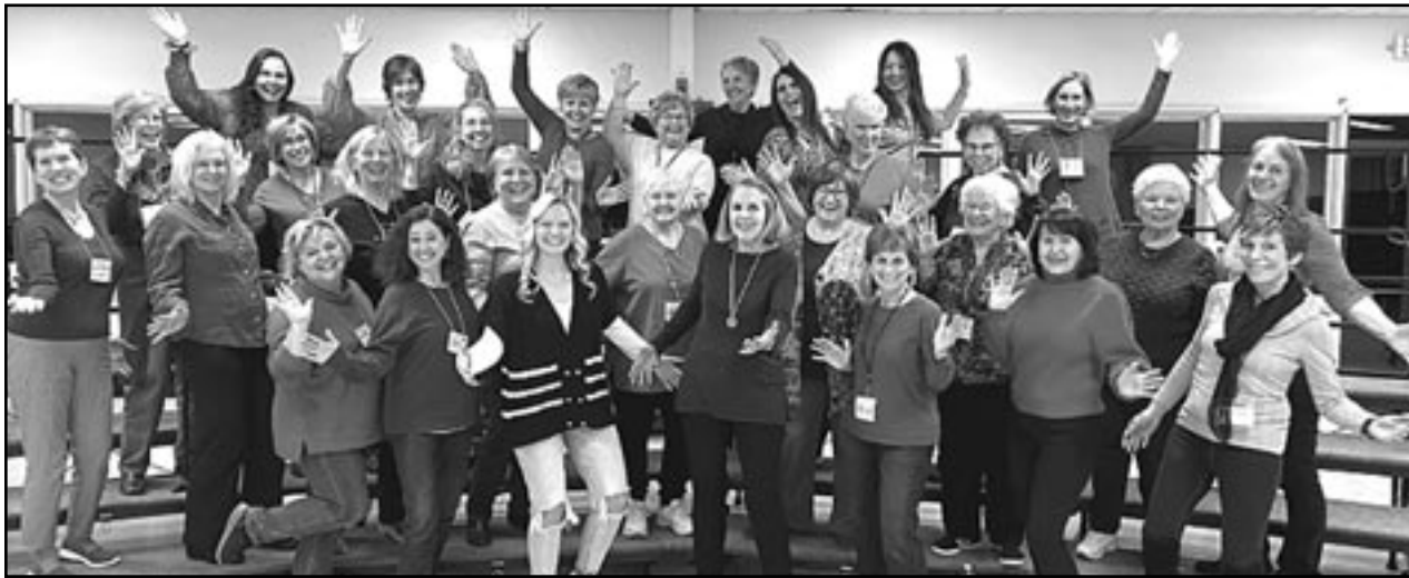
(above) The Hickory Tree award-winning women's chorus is hosting free events on January 8 and 15, 2025, from 6:45 to 9:30 p.m. at The Shrine of St Joseph, 1050 Long Hill Road, Stirling, NJ.

Please contact the Chorus for the Winter Sing-Along by email at info@hickorytreechorus.org . Find more information at hickorytreechorus.org .