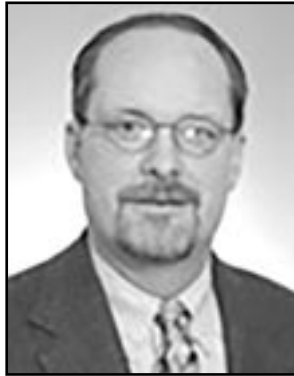
(above) Scott Walker