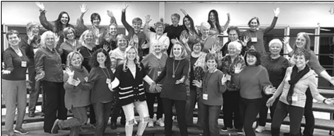
(above) The Hickory Tree award-winning women's chorus is hosting free events on January 8 and 15, 2025, from 6:45 to 9:30 p.m. at The Shrine of St Joseph, 1050 Long Hill Road, Stirling, NJ.

Please contact the Chorus for the Winter Sing-Along by email at info@hickorytreechorus.org . Find more information at hickorytreechorus.org .