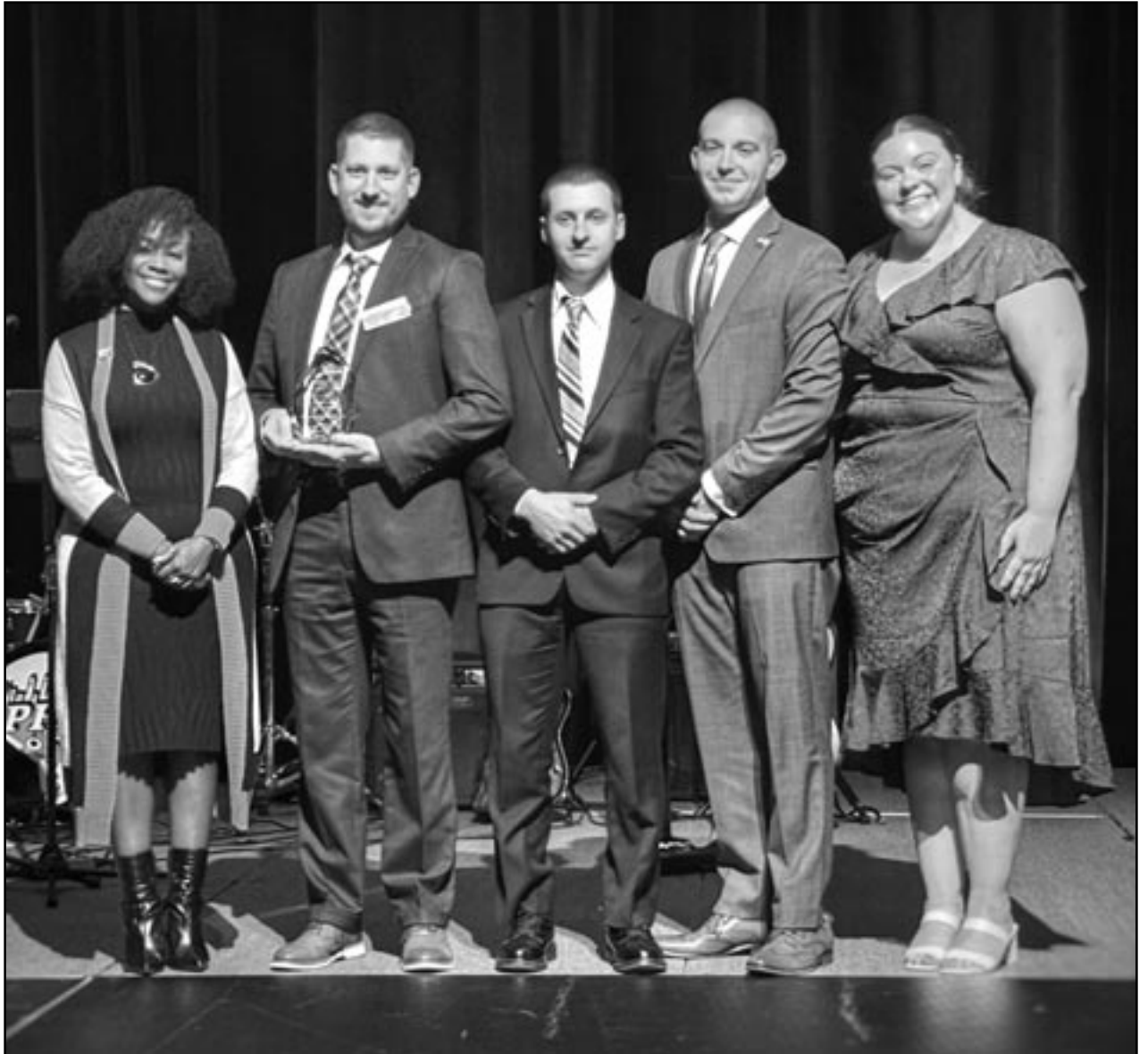
(above) Members of the Mountainside Rescue Squad accepting the 2024 Prehospital Program of the Year award.

We thank all Mountainside Rescue Squad members, past and present, as well as the Mayor and town council, the Watts Foundation, and the residents of the Borough of Mountainside for their support.