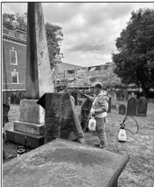
(above) The recent restoration and cleaning of the James and Hannah Caldwell Memorial Obelisk at Siloam-Hope First Presbyterian Church in Elizabeth was commissioned by the Union County Historical Society.

For more information visit unioncountyhistoricalsocietynj.org .