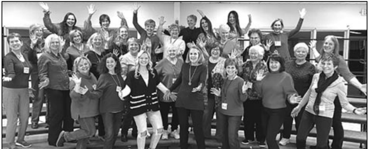
(above) The Hickory Tree award-winning women's chorus is hosting free events on January 8 and 15, 2025, from 6:45 to 9:30 p.m. at The Shrine of St Joseph, 1050 Long Hill Road, Stirling, NJ.

Please contact the Chorus for the Winter Sing-Along by email at info@hickorytreechorus.org . Find more information at hickorytreechorus.org .