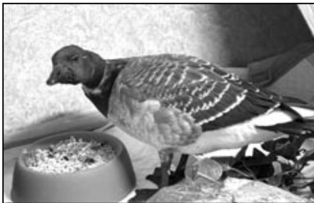
(above) We're thrilled to see this Brant goose take to the skies (or water) once more! It was a charming patient.

The Raptor Trust is a 501(c)3 non-profit organization located at 1390 White Bridge Rd., Millington, NJ. They provide free care and assistance to injured, sick, or orphaned wild birds. They offer educational programs to the public about wild birds, especially birds of prey. They strive to provide a human example for others. For more information about upcoming events, to make a donation, and volunteer opportunities visit info@theraptortrust.org . To report an injured wild bird call 908-647-2353.