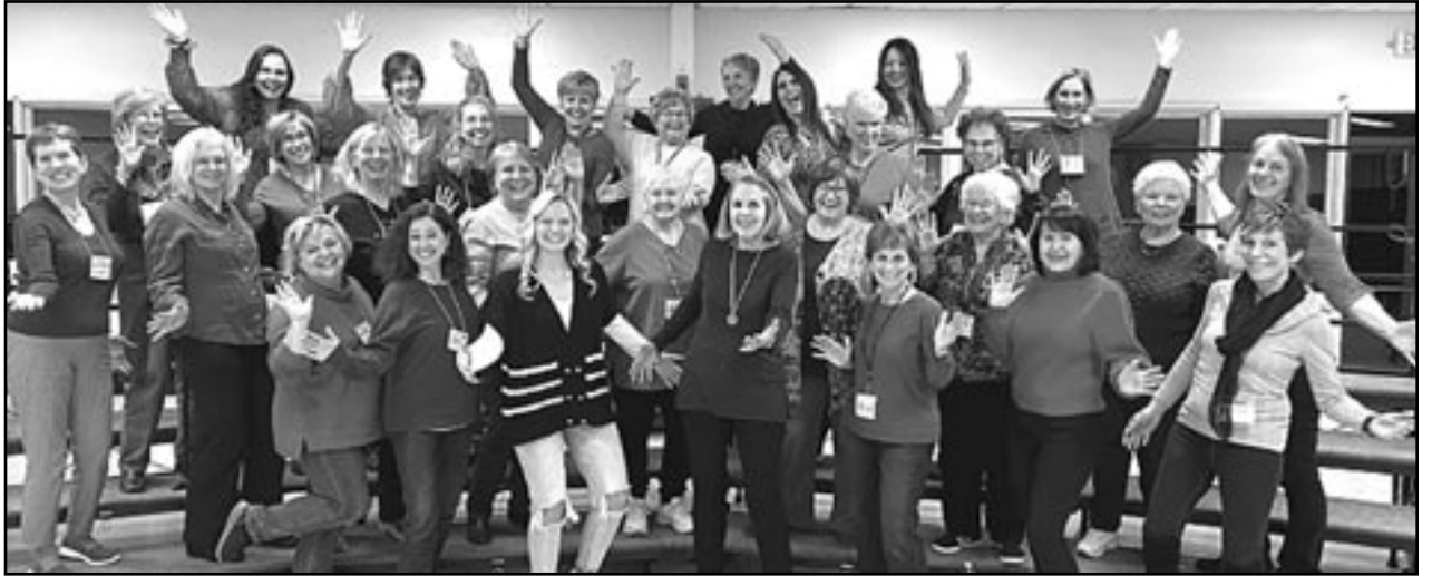
(above) The Hickory Tree award-winning women's chorus is hosting free events on January 8 and 15, 2025, from 6:45 to 9:30 p.m. at The Shrine of St Joseph, 1050 Long Hill Road, Stirling, NJ.

Please contact the Chorus for the Winter Sing-Along by email at info@hickorytreechorus.org . Find more information at hickorytreechorus.org .