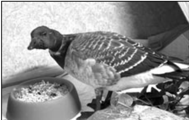
(above) We're thrilled to see this Brant goose take to the skies (or water) once more! It was a charming patient.

The Brant goose, with its compact size and striking black-and-white plumage, is a remarkable bird. Adapted to drink saltwater, these geese embark on long migratory journeys from their Arctic breeding grounds to coastal winter