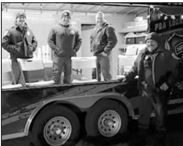
(above) Hanover Township PBA #128 prepared and served hot chocolate at the event.